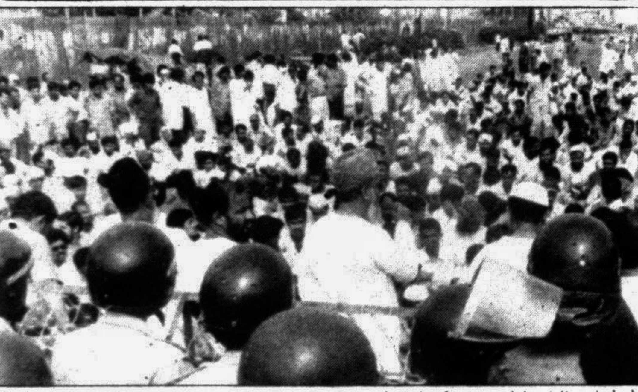
Maulana Muttar Rahman Nizami, the secretary general of the Jamaat-e-Islami Bangladesh addressing a rally at Maghbaraz in the city yesterday.