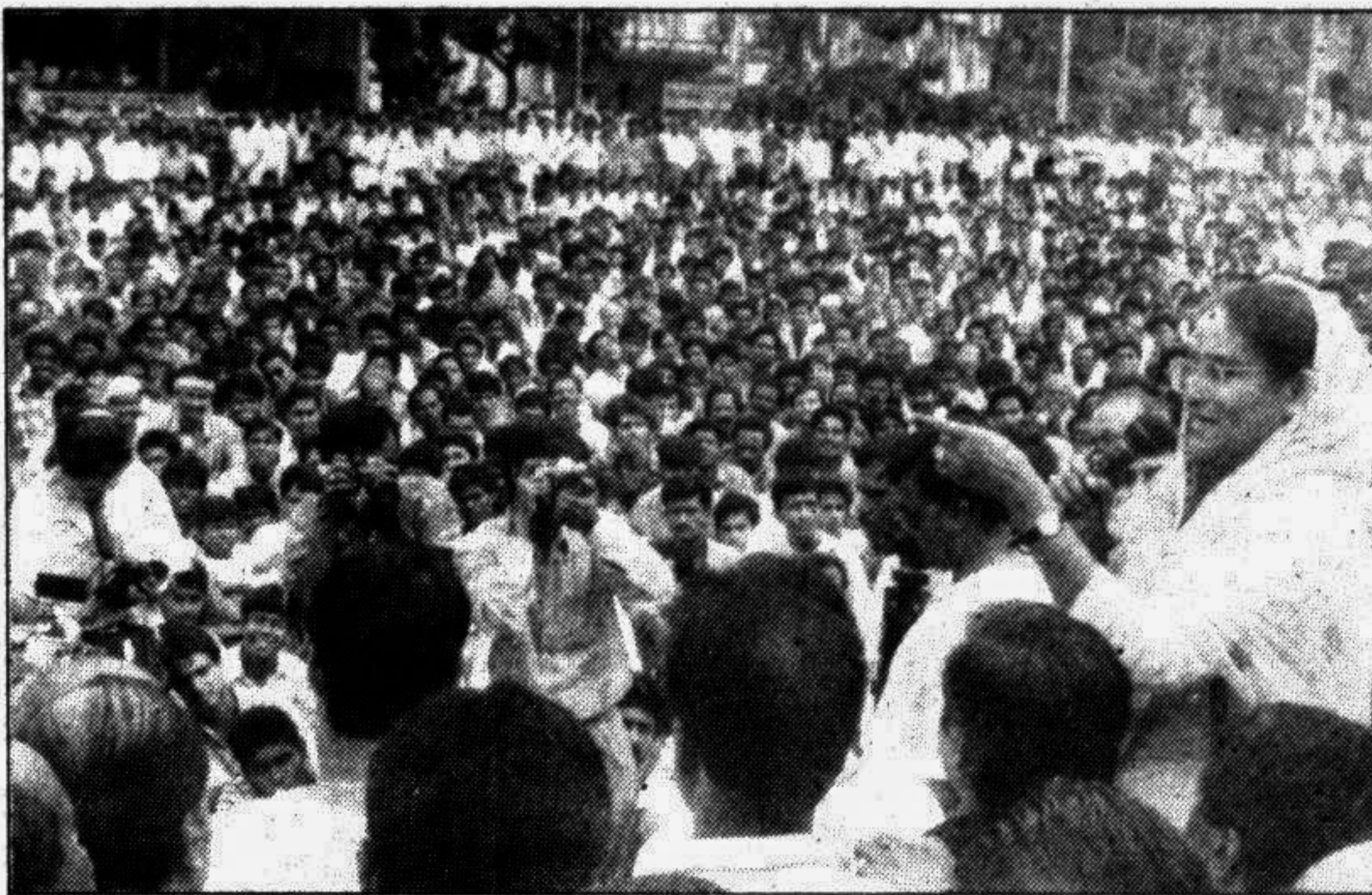
Awami League chief and leader of the opposition in Parliament Sheikh Hasina addressing a rally at Sobhanbagh in the city yesterday.

In fact, in course of a decade, the whole attitude, behaviour pattern, taste and outlook of the youths of the country have undergone a far-reaching change. This change is perhaps inevitable because of the wide-ranging influence exercised by the mass media like the press, radio and the TV which bring home to them the new ideas taking shape in all spheres of life in other parts of the world. In this respect, the impact of western culture is no less potent. Lately, through satellite TV, the youths are getting acquainted with new culture and ethos of the outside world which tend to influence our youths in all aspects of their life style.