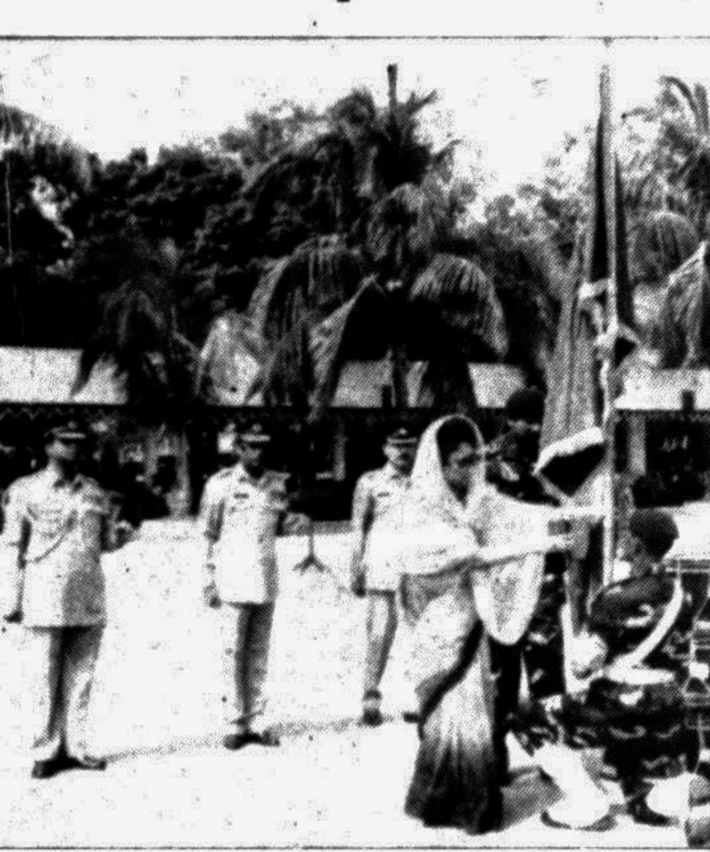
Prime Minister Begum Khaleda Zia presenting National Standards to the Duhshashik Panero and Majestic Tigers, two battalions of the East Bengal Regiment of the Bangladesh Army at the East Bengal Regimental Centre, Chittagong Cantonment yesterday.