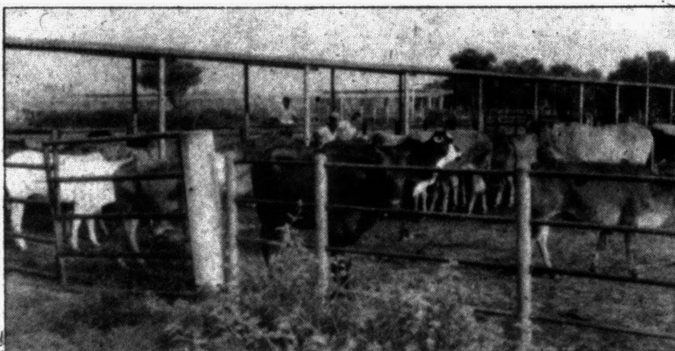
Local and foreign species of cows and bulls in the farm's grass field.

is done by crossing indigenous cow with Freisian species. Shahiwal species with Freisian species, Shahiwal species with Shahiwal species and Freisian