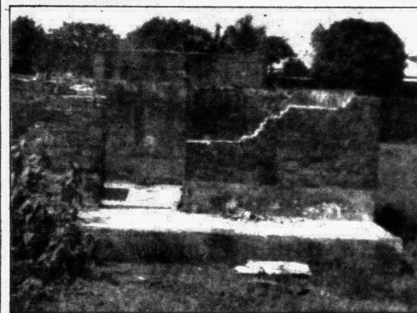
SIRAJGANJ: The dilapidated morgue of Sirajganj sadar hospital.

possible here due to many reasons. The roof of the morgue was not replaced ever since it was blown away. Numerous cracks have developed on the walls and major portion of a wall on the north side has collapsed. The cement-made bench is used to accommodate the bodies for autopsies. When