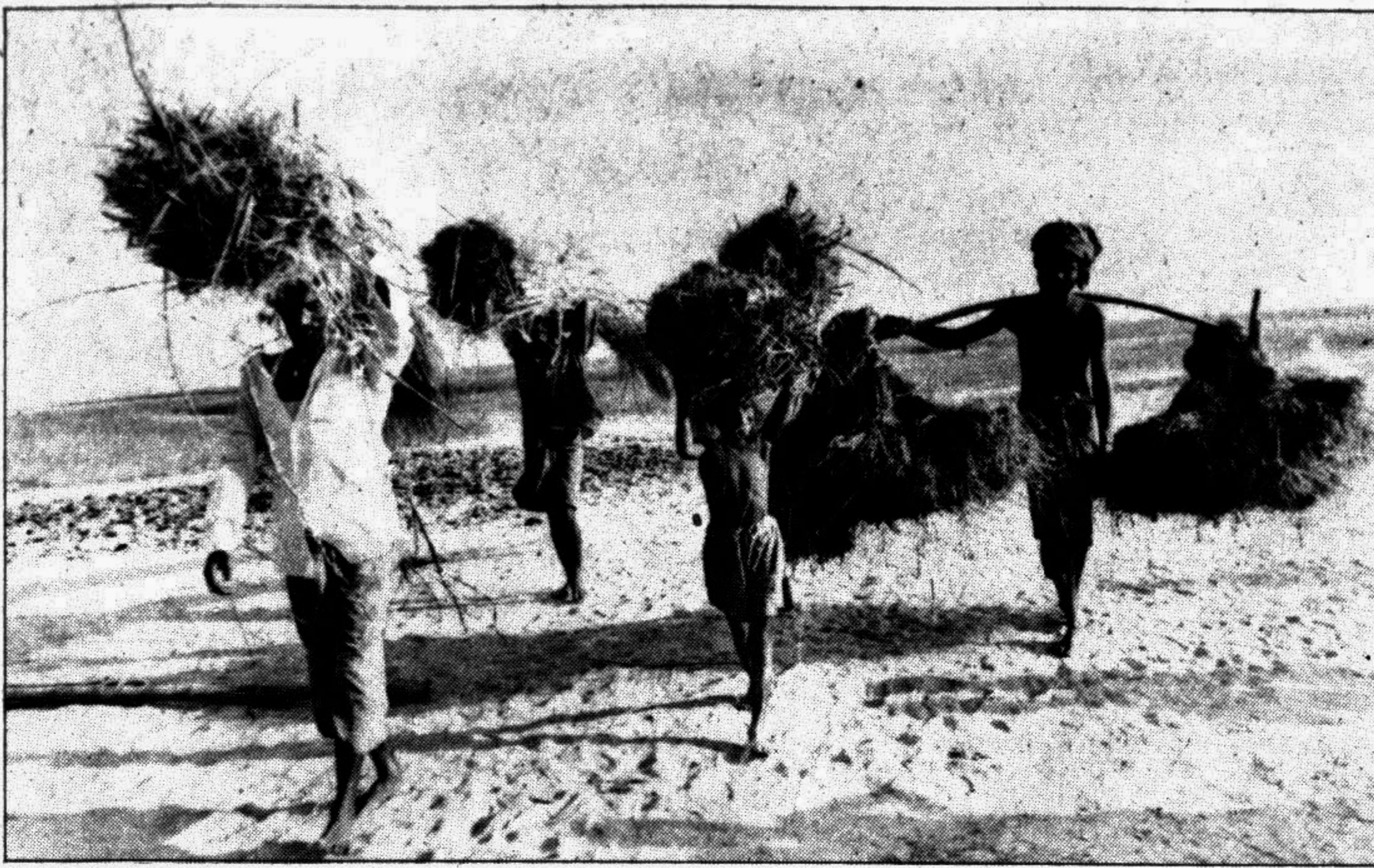
WHAT COULD BE WORSE? The recent drought situation in the northern part of the country has destroyed aman crops on vast areas affecting thousands of farmers. This picture shows farmers carrying dry aman plant to sell at the local market in Chilmari area in Lalmonirhat district.