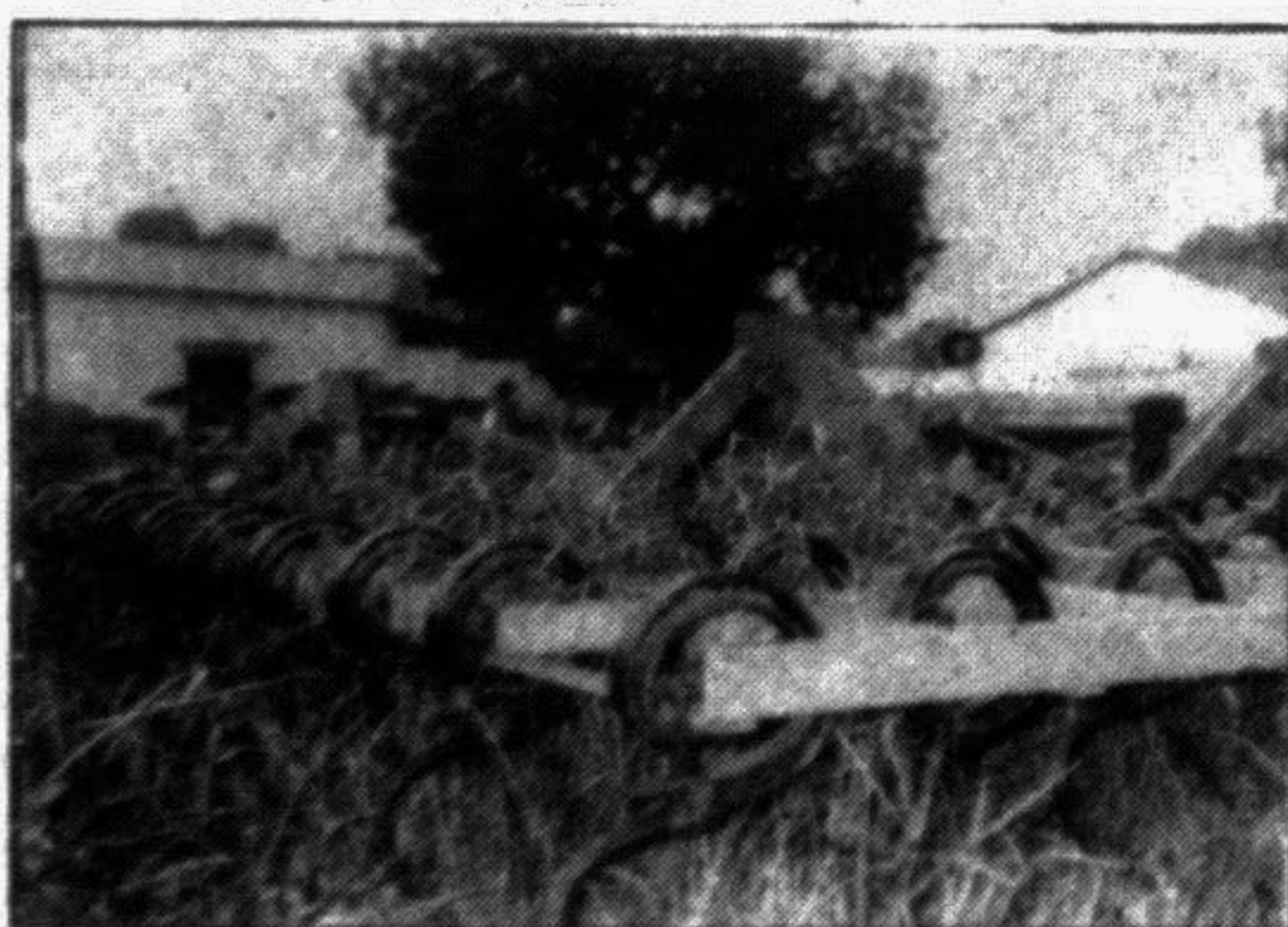
Machines worth crores of taka are left in an open field inside the farm.

Joyal in a confessional statement admitted that he was assigned to hand over a packet of 500 gram of heroin to a person in Dhaka. He also received an amount of Taka 10,000 for performing such an assignment.