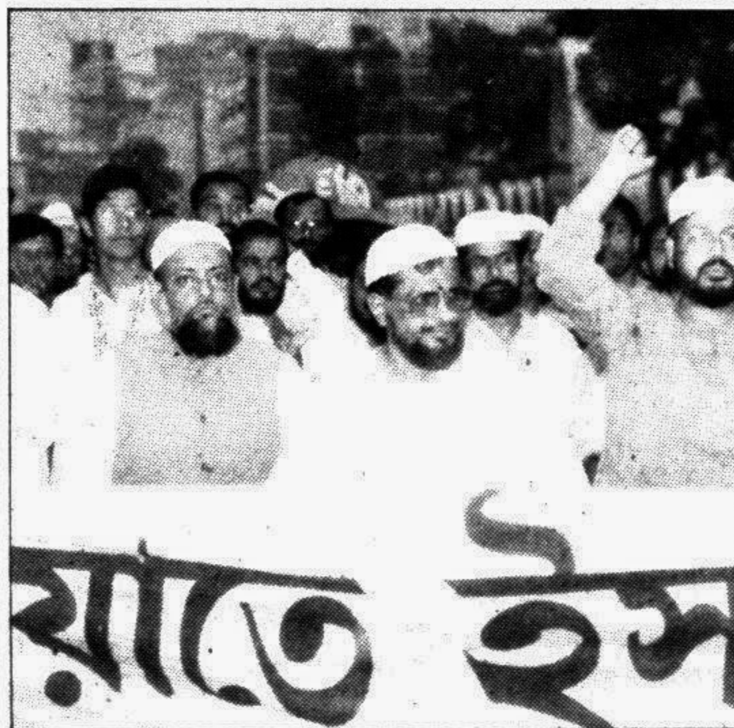
The Jamaat-e-Islami brought out a procession in the city yesterday to drum up support for today's PM's Secretariat gherao programme.

The meeting discussed matters relating to 11-point demand of the Parishad including improvement of service structure, training of the teachers, promotion and higher education of the polytechnic teachers at all levels. The minister gave patient hearing to the demand of the Parishad and assured them to solve these problems within shortest possible time.