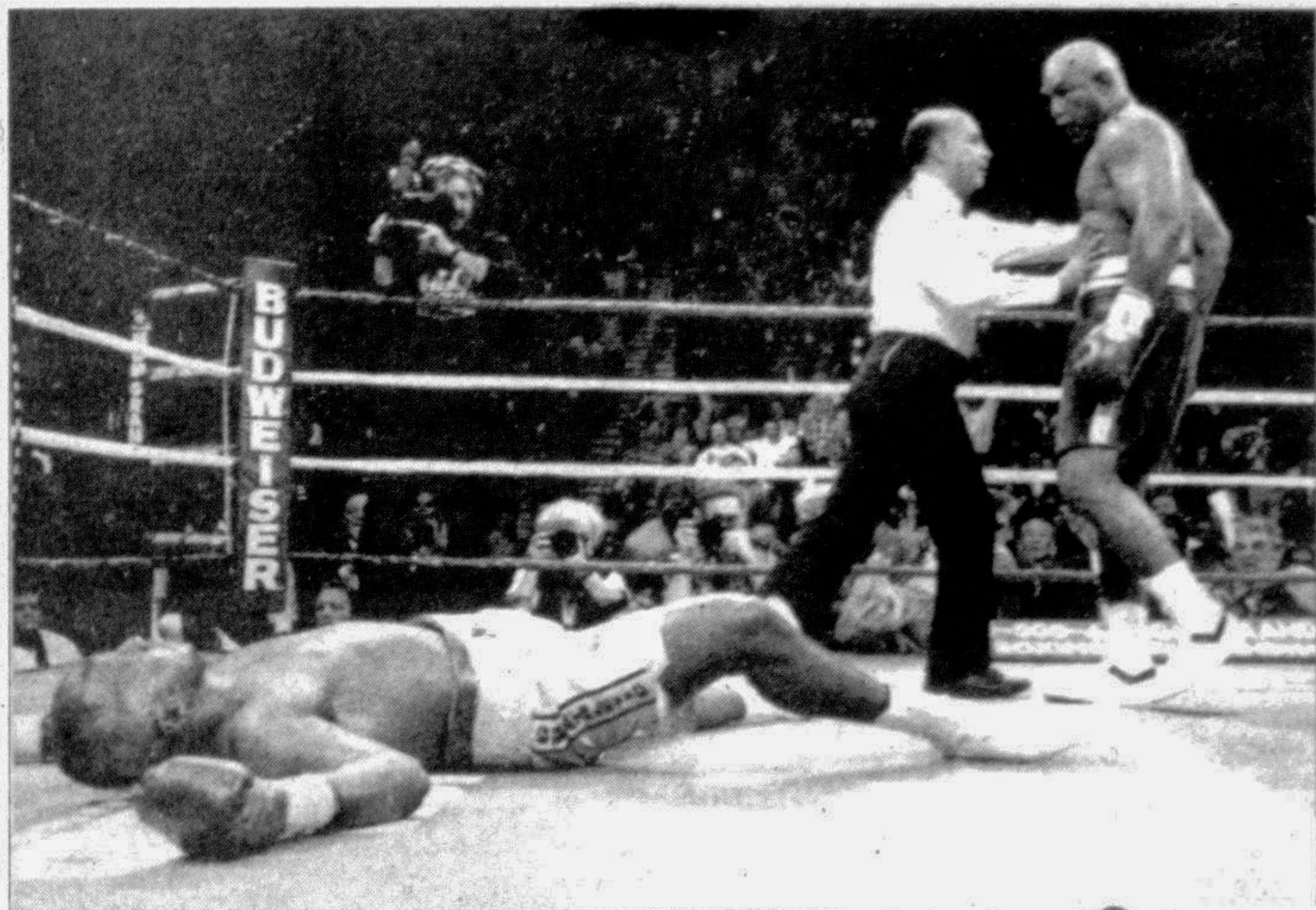
Referee Joe Cortez pushes George Foreman away as Michael Moorer lies prostrate in the tenth round of their scheduled 12 round title bout in Las Vegas on Nov 5. Foreman, 45, created boxing history after becoming the oldest heavyweight champion.

MELBOURNE, Nov 6: Dean Jones intends to break his retirement from international cricket if the Australian Cricket Board guarantees him the captaincy of the Australian A team this summer, reports AFP. Jones, who led Victoria to victory over New South Wales with an unconquered century here Saturday, said he did not want to be remembered as a filler in for the Australian A team with no assurances of playing international cricket again. "I've got to keep my integrity," Jones said Saturday. "If they want me to be captain of the Australian A team and they want me to come out of retirement I'll do it." "I'm not going to come out of retirement and leave all the options to the selectors." "I'm not going to end up playing second eleven cricket when I know I'm good enough to play for the first team." Jones, who has a Test average of 46.55 with 11 centuries in 52 Tests, retired from international cricket earlier this year while on the South African tour. But it may have been a premature decision as Australia will play a second eleven in the upcoming World Series Cup one-day international series with England and Zimbabwe.