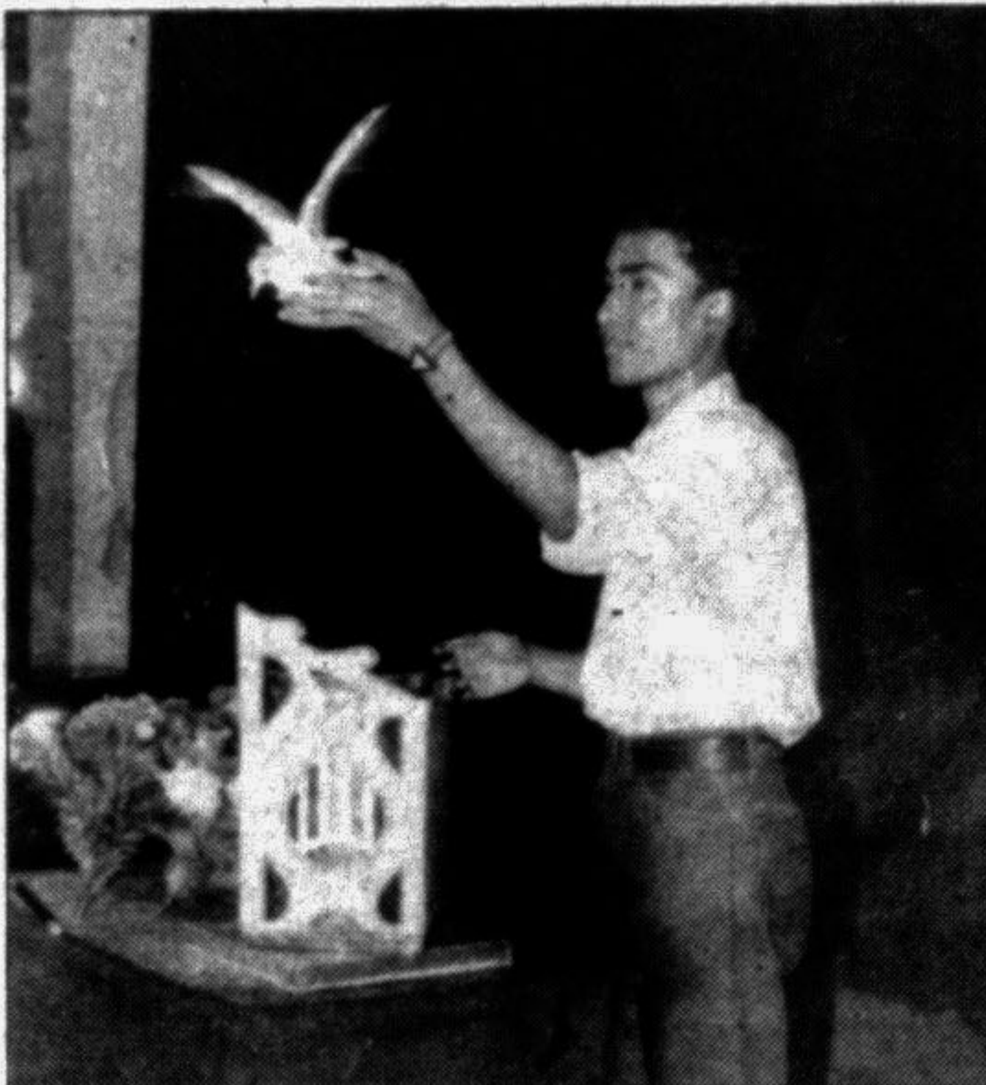
A magician performing tricks at the National Magic Festival '94 held at city's Shilpakala Academy auditorium yesterday. The Bangladesh Jadukar Parishad, an organisation of magicians, organised the festival.