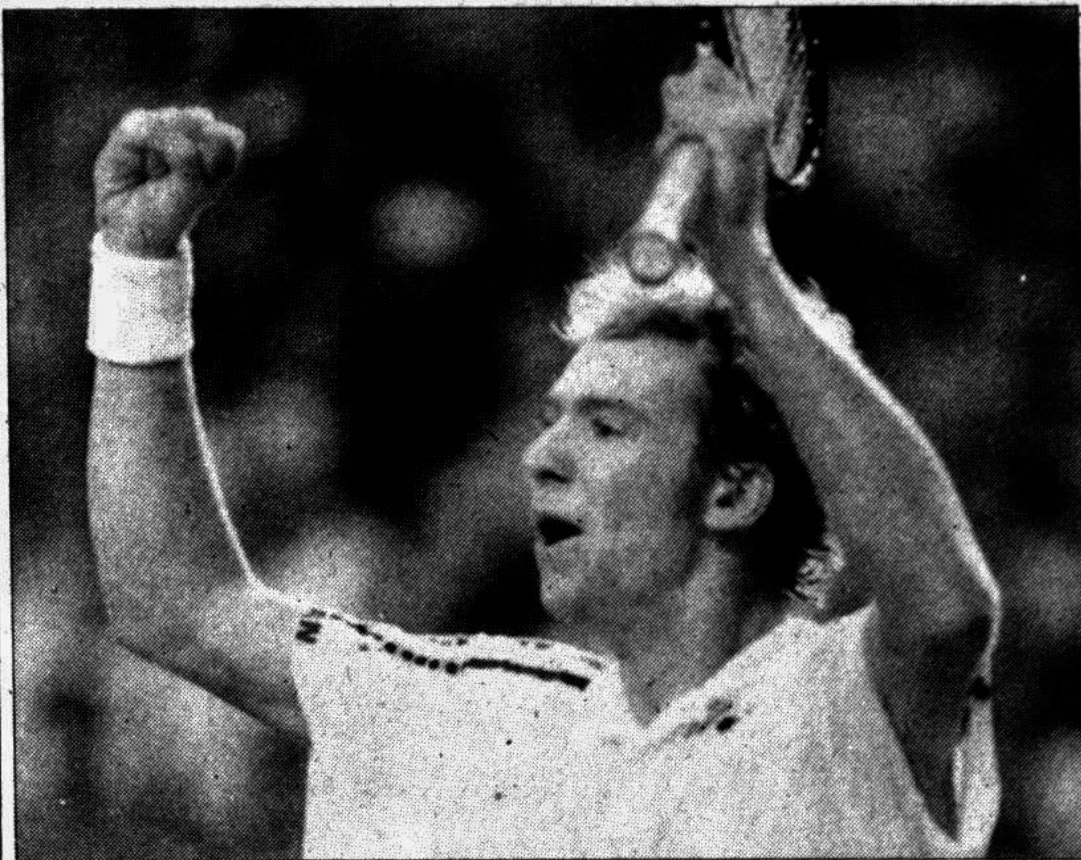
Swiss Marc Rosset rejoices after beating German Boris Becker in the quarterfinals of the Bercy Open tennis in Paris on Friday. The big-serving Swiss won the match 7-6 (7-3), 7-6 (9-7).