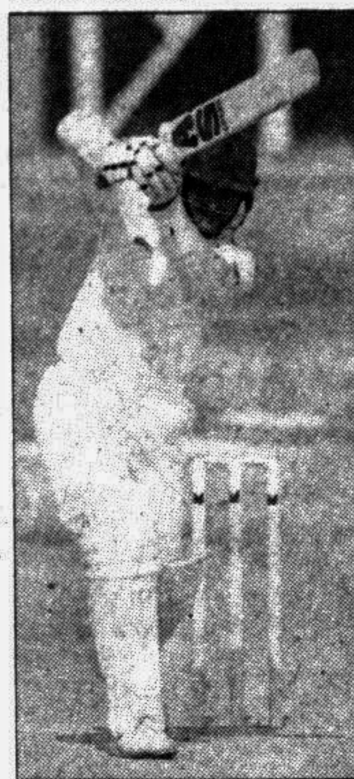
CAMPBELL ... 131 n.o

Scoreboard in the second 50 overs one-day cricket international between Zimbabwe and Sri Lanka at Harare Sports Club on Saturday: