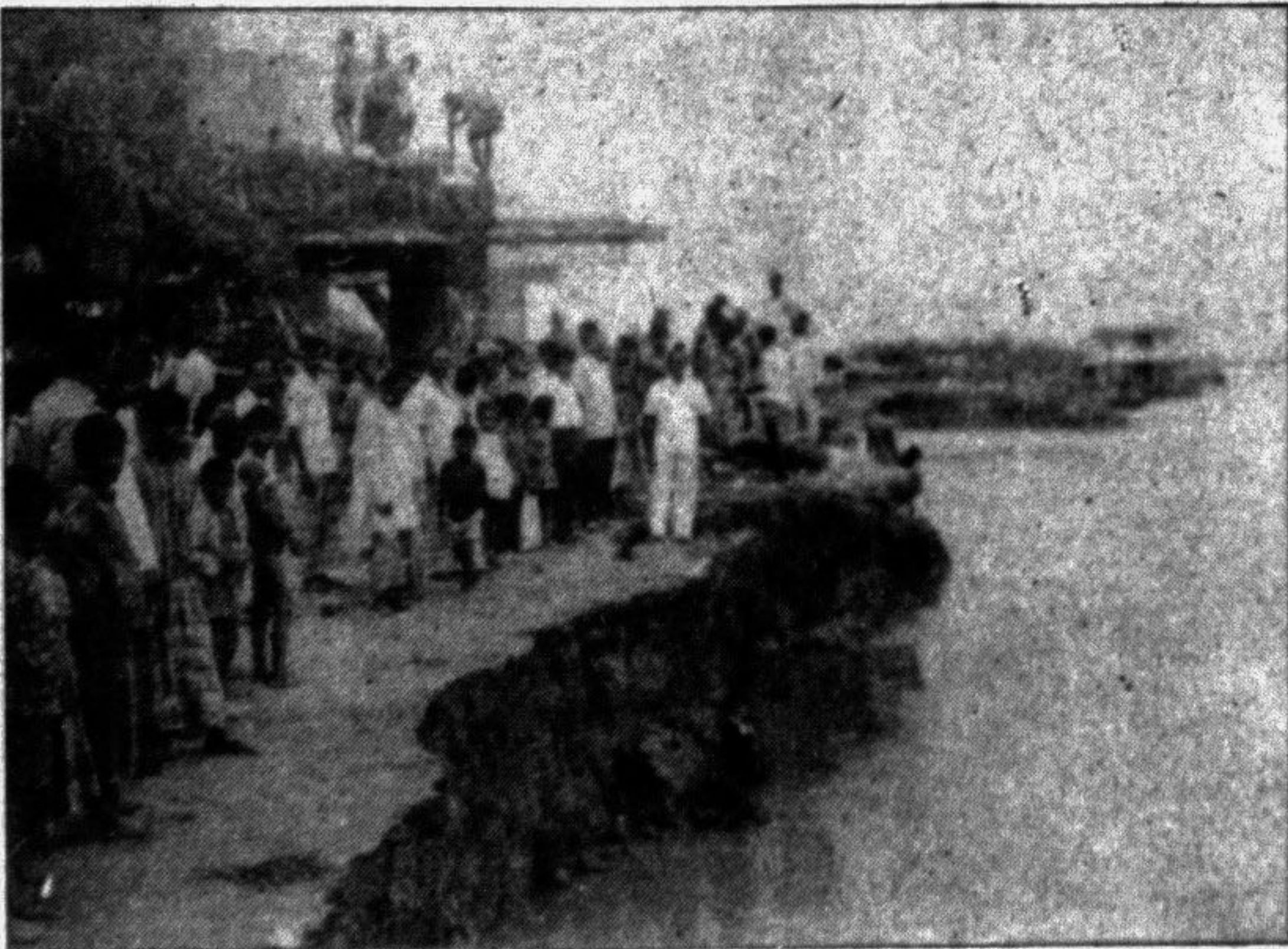
GAIBANDHA Erosion of river Brahmaputra continues in Fulchhari thana. The thana headquarters building is threatened by the erosion.