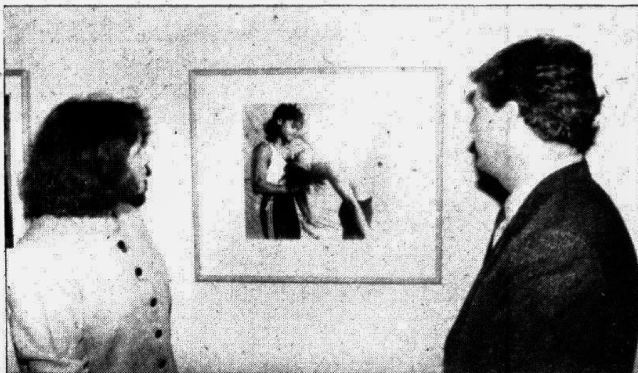
Visitors on the inaugural day of a seven-day long aboriginal art exhibition at city's Shilpakala Academy auditorium yesterday. The Shilpakala Academy and the Australian High Commission have jointly organised the exhibition.