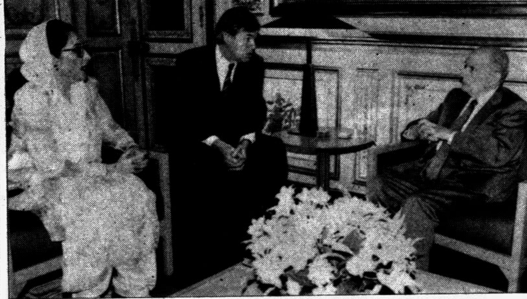
Pakistani Prime Minister Benazir Bhutto (L) talks through an interpreter (C) with French President Francois Mitterrand (R) on Thursday at the Elysee Palace in Paris.