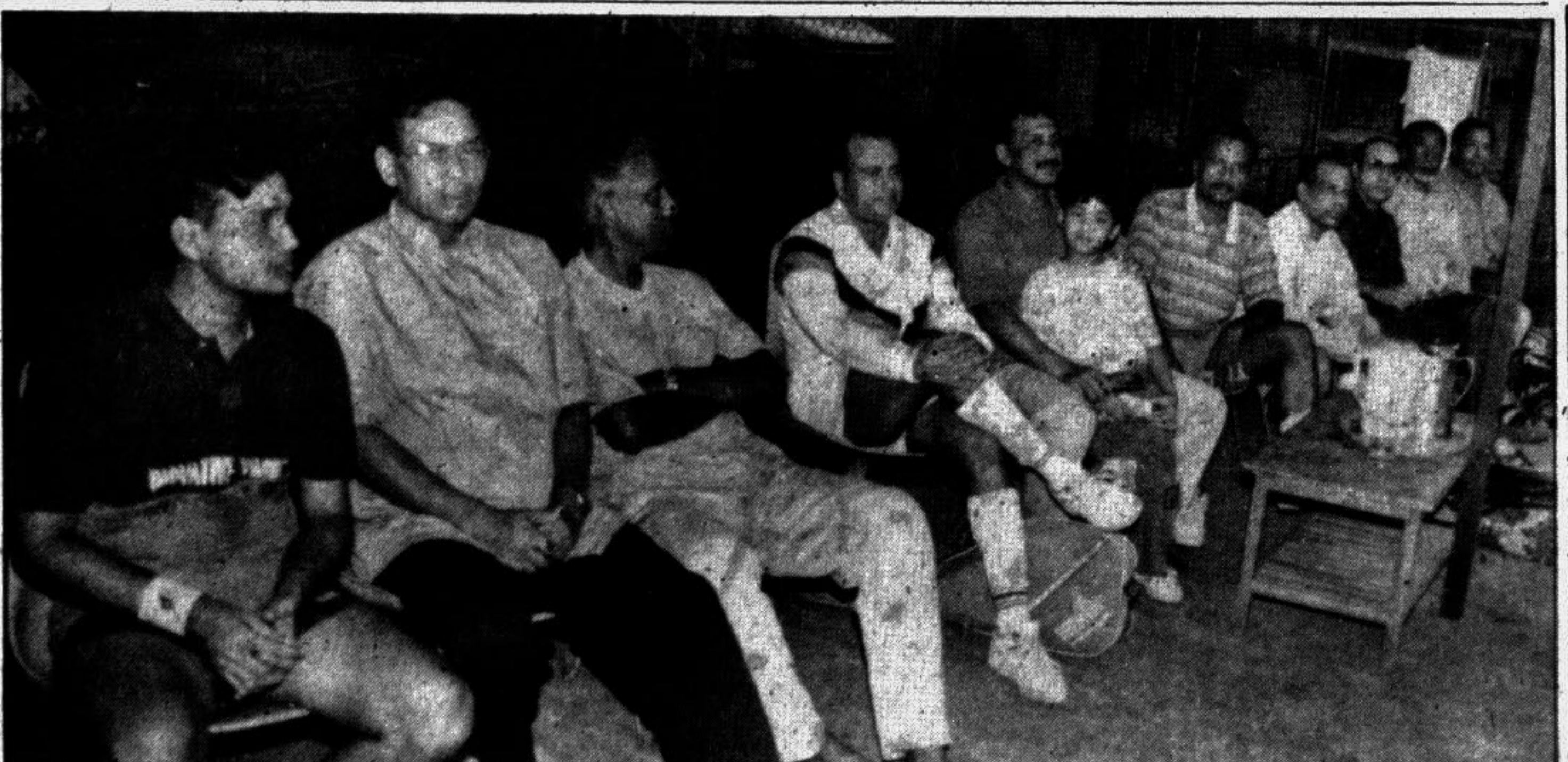
Spectators watching proceedings of the Nasiruddin memorial tennis tournament at the Officers' Club tennis court yesterday.

Mohsin Club will take on Sonakanda White Club in the only engagement tomorrow at the same venue.