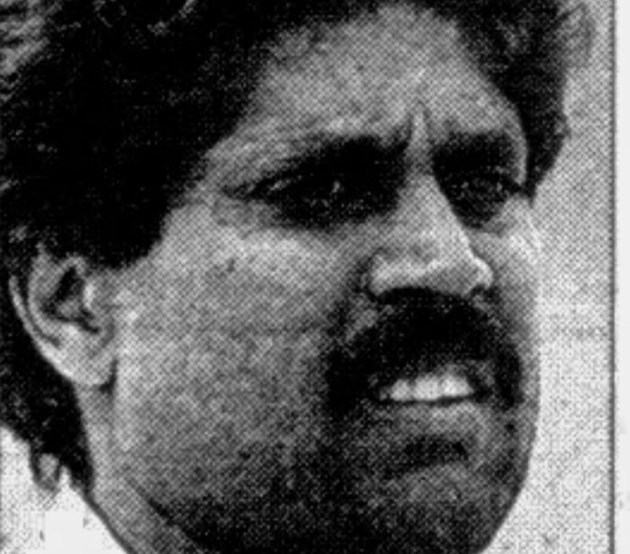
KAPIL DEV style by straight-driving four consecutive sixes.

India needed 24 to avoid the follow-on with one wicket left, and Kapil boldly answered the challenge in magnificent