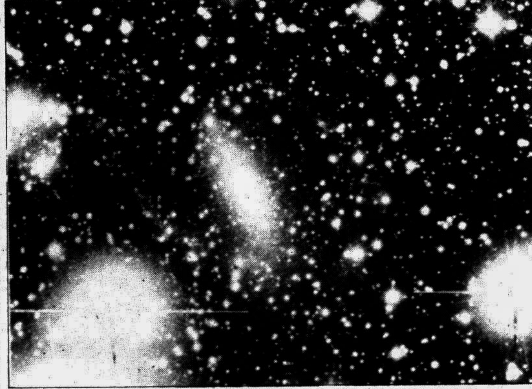
A large spiral galaxy of stars hidden from direct view behind the Milky Way, recently discovered by astronomers who have named it "Dwingeloo 1" after the Isaac Newton Telescope used to find it.

day official visit to France, told the committee "I urge France to try to convince India to accept the offer of the Secretary General Boutros Boutros-Ghali of the United Nations to facilitate the search for a lasting solution to the Kashmir issue." She said Kashmir was the "core issue" dividing Pakistan and India and linked it with the nuclear non-proliferation question, while denouncing human rights violations by India in Kashmir. "I stand ready on behalf of Pakistan to sign the Nuclear Non-proliferation Treaty with Prime Minister P V Narasimha Rao of India signing with me. Is he ready to make the same commitment?" Benazir said. "But negotiations and treaties require two partners. We do not lack the will to im-