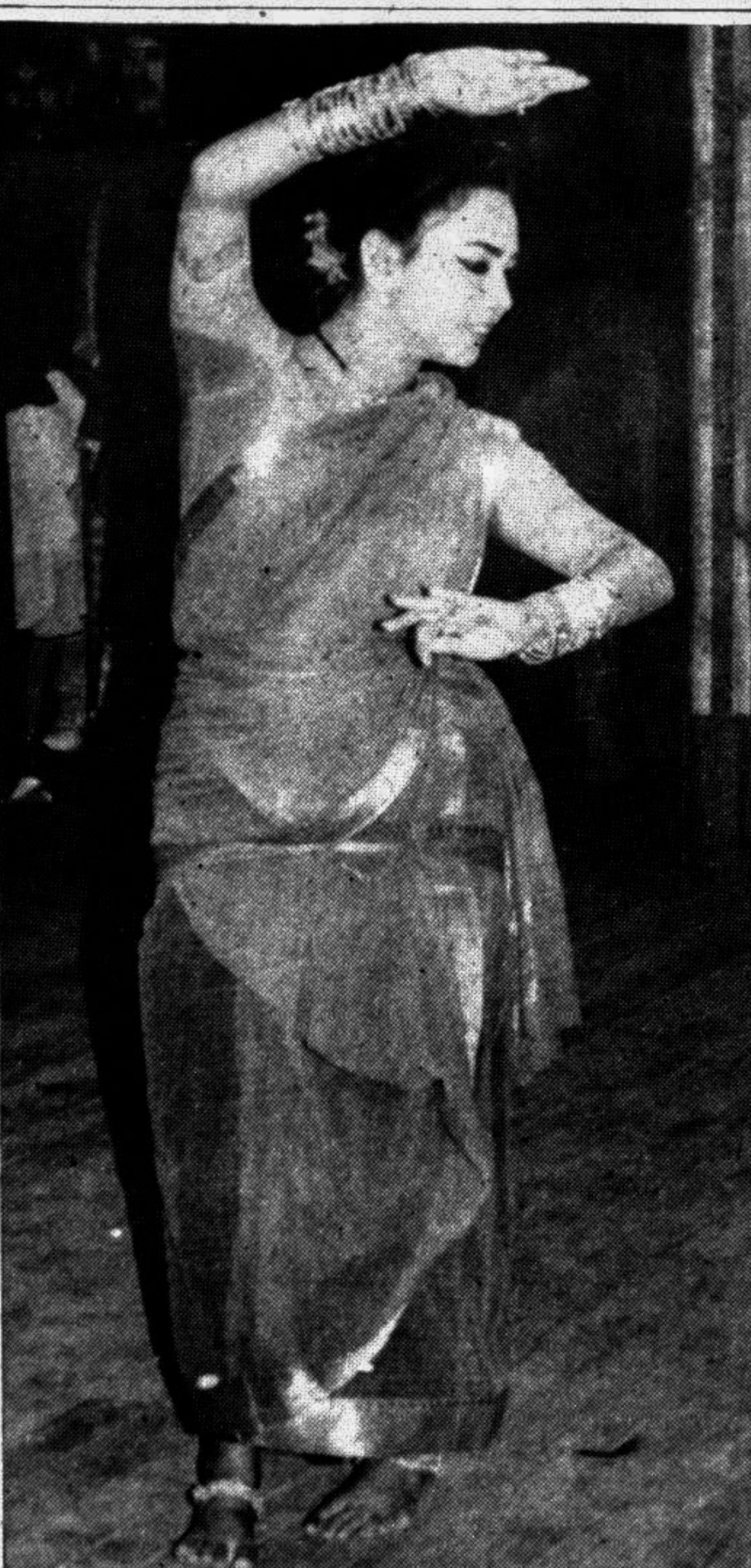
A performer of the Kranti Shilpi Gosthi, a cultural organisation, at a dance programme at city's Institution of Engineers auditorium yesterday. The programme was organised on the occasion of the organisation's biennial conference.