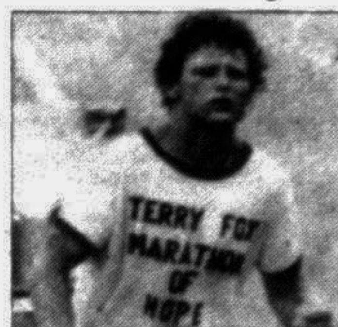
A Terry Fox Run to raise money and awareness of cancer in their respective countries.