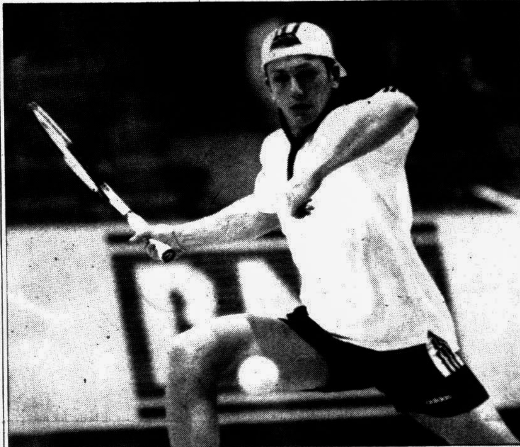
Frenchman Lionel Roux plays forehand winner against German Michael Stich during their first round match at the Paris Open on Nov 1. Roux upset third-seed Stich 6-4, 6-4.

In first-round matches Guy Forget beat fellow Frenchman Guillaume Raoux, 6-4, 6-4; Jakob Hlasek of Switzerland, who has played in all nine Paris Opens, defeated Javier Sanchez of Spain, 7-5, 6-4 and Paul Haarhuis of the Netherlands downed Czech Daniel Vacek, 7-6 (7-4), 6-2. Vacek was a late replacement for American Maliv Washington who injured an ankle.