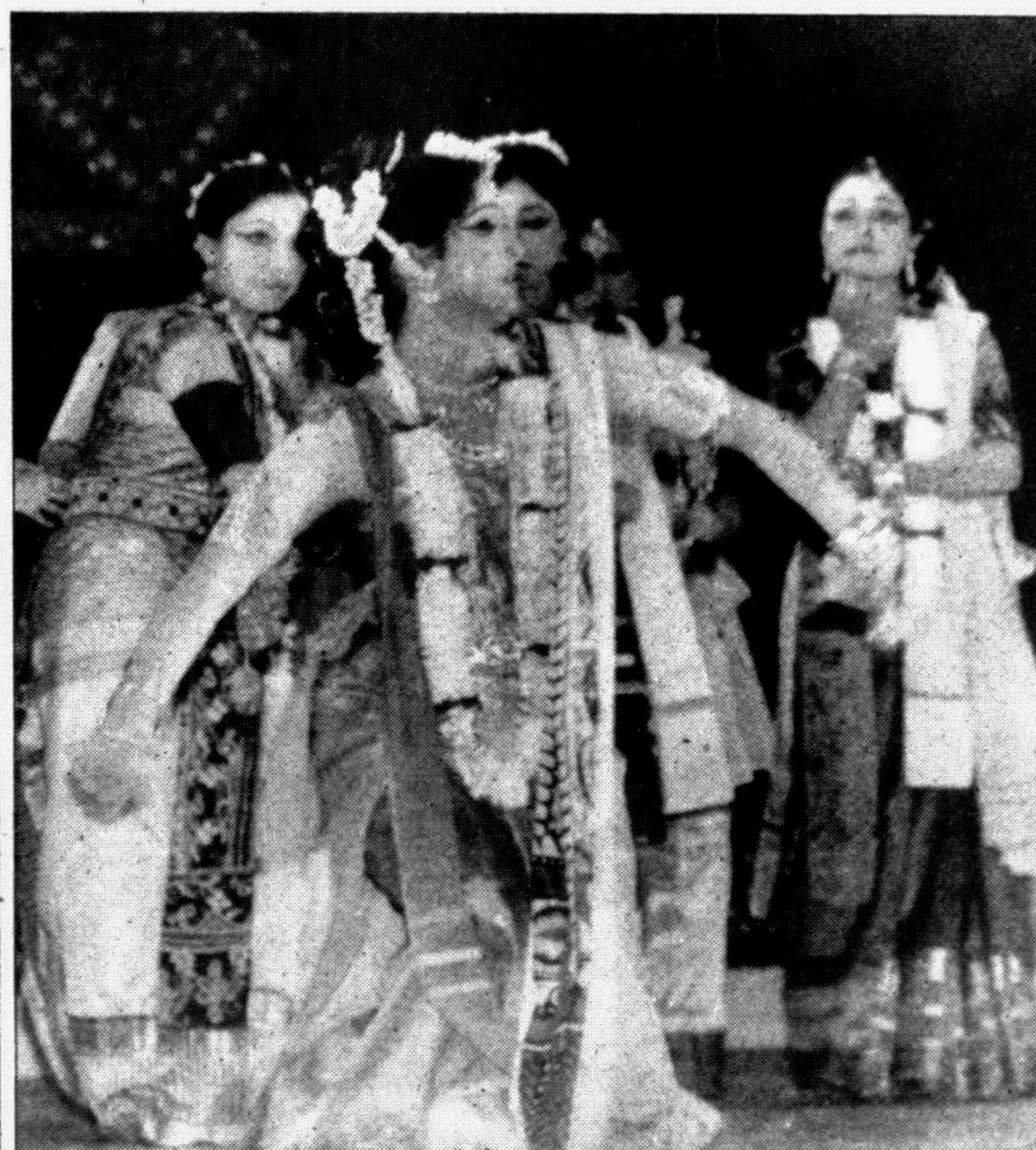
Artists of Shantiniketan, West Bengal, presenting Rabindranath Tagore's dance drama Shyama at the National Museum auditorium yesterday. The programme, organised by a cultural organisation Surer Dhara, was conducted by Kanika Banerjee, a leading Tagore song exponent of India.

The missing included at least 10 men trapped in a mosque during dawn prayers and a maintenance crew working inside the storage complex.