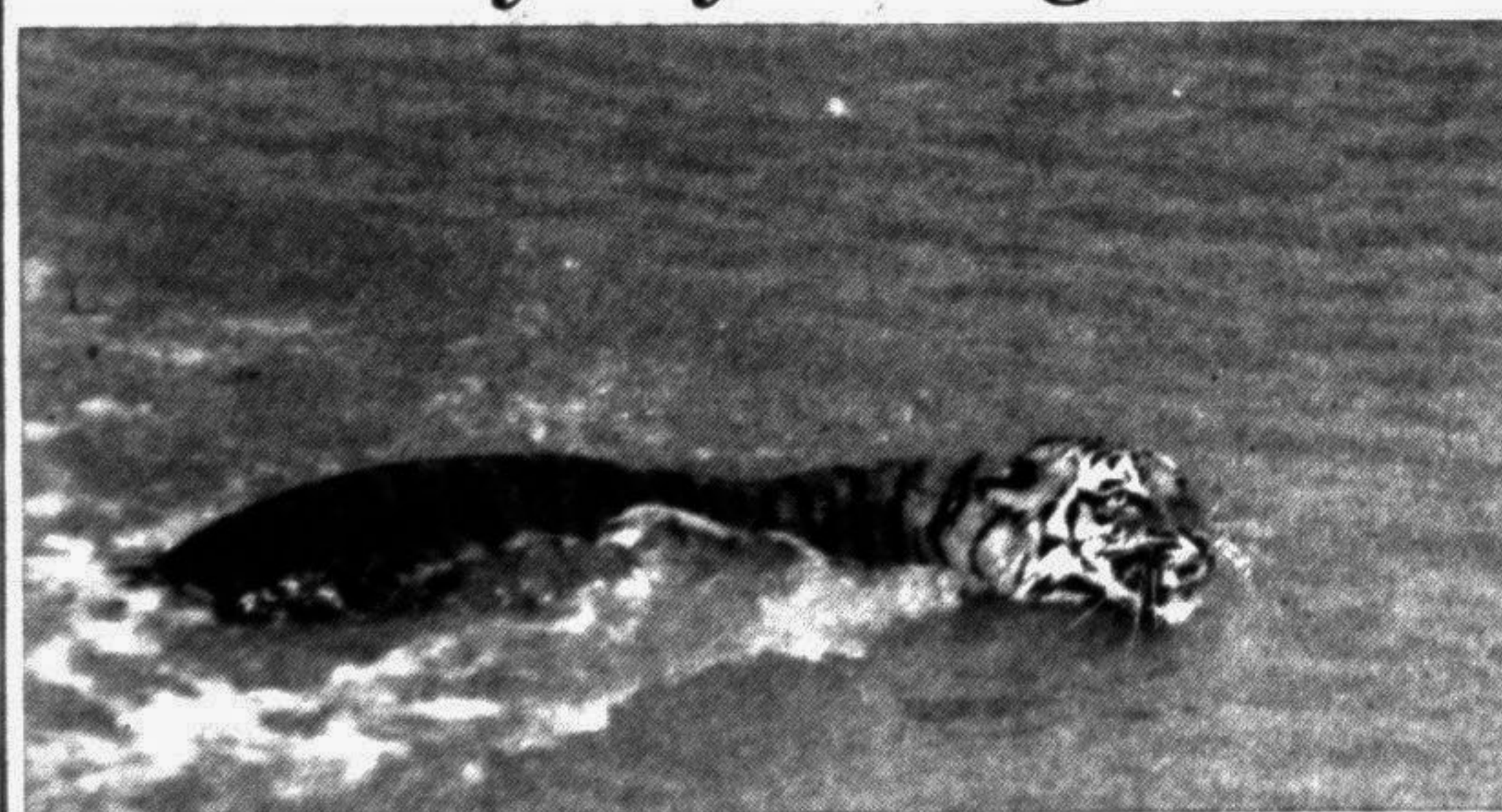
An adult Royal Bengal tiger wading across a creek of the Sundarbans.