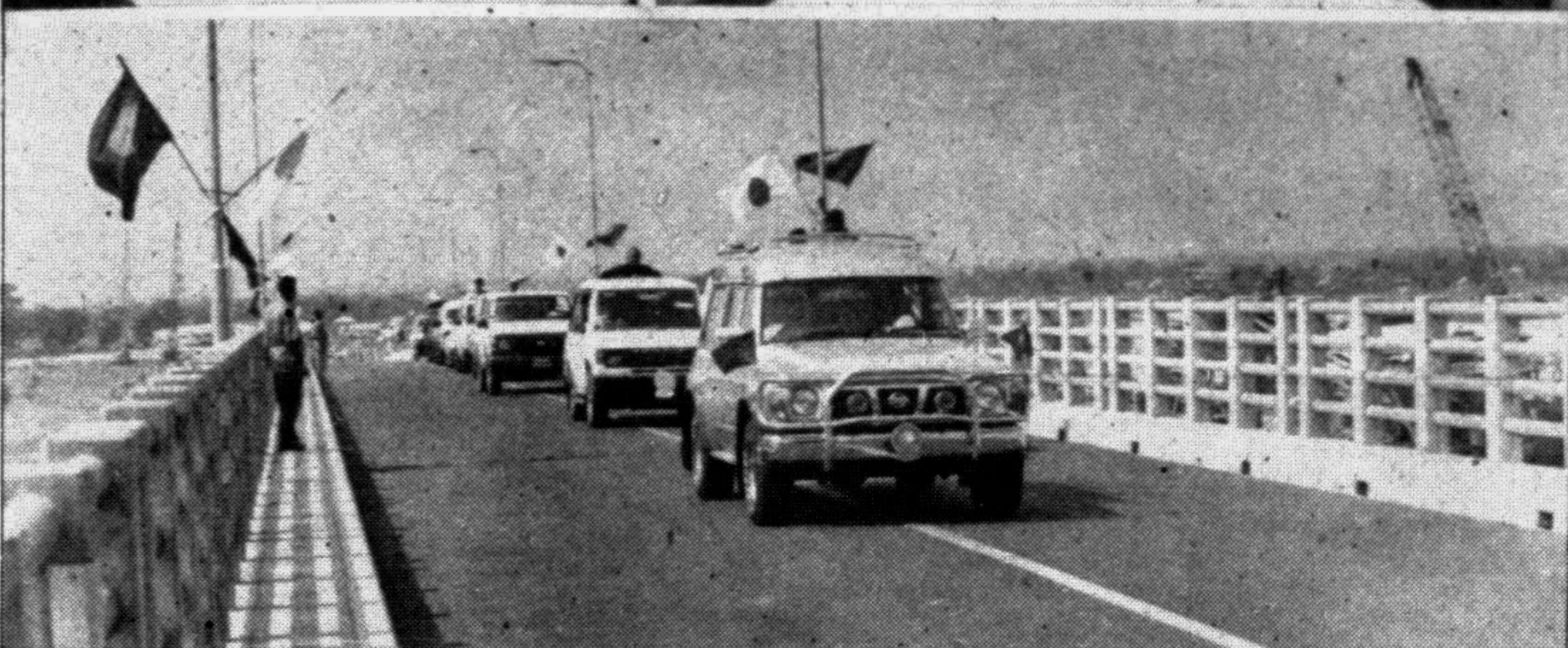
Long-cherished dream of the teeming millions now turned into a reality: pictorial view of the formal inauguration of the country's longest ever bridge called Japan-Bangladesh Friendship Bridge II (Meghna-Gumti Bridge) at Daudkandi yesterday by Prime Minister Begum Khaleda Zia. Emblem of the bridge (1), Prime Minister is unveiling the plaque with Communications Minister Oli Ahmed on her right (2) and after formal opening of the bridge, the Prime Minister is seen crossing it over in a motorcade (3).