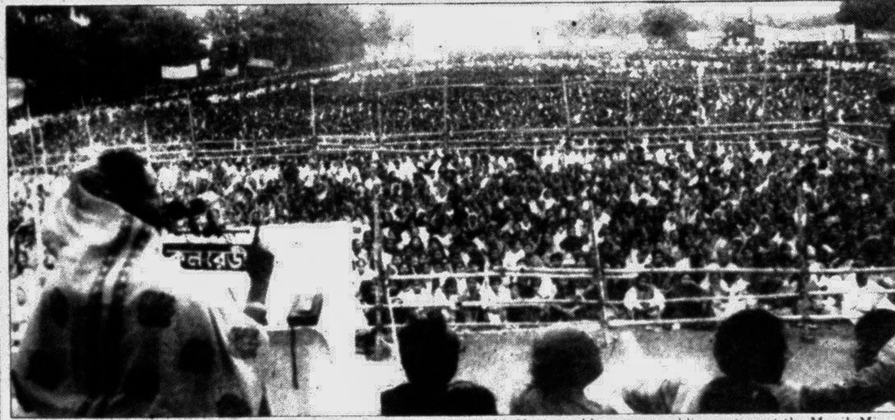
Awami League chief and Leader of the Opposition in Parliament Sheikh Hasina addressing a public meeting at the Manik Mia Avenue in the city yesterday.

A total solar eclipse will occur tomorrow, the Bangladesh Meteorological department said yesterday. The eclipse of five hours and eight minutes duration will not be visible anywhere in Bangladesh. The eclipse will start at 5:05 pm (BST) and will end at 10:13 pm. The central eclipse will begin at 6:03 pm and will end 9:15 pm while the greatest eclipse will occur at 7:39 pm. The maximum duration of the total phase of the eclipse will be four minutes and 27.5 seconds. Magnitude of the eclipse will be 1.055, reports BSS.