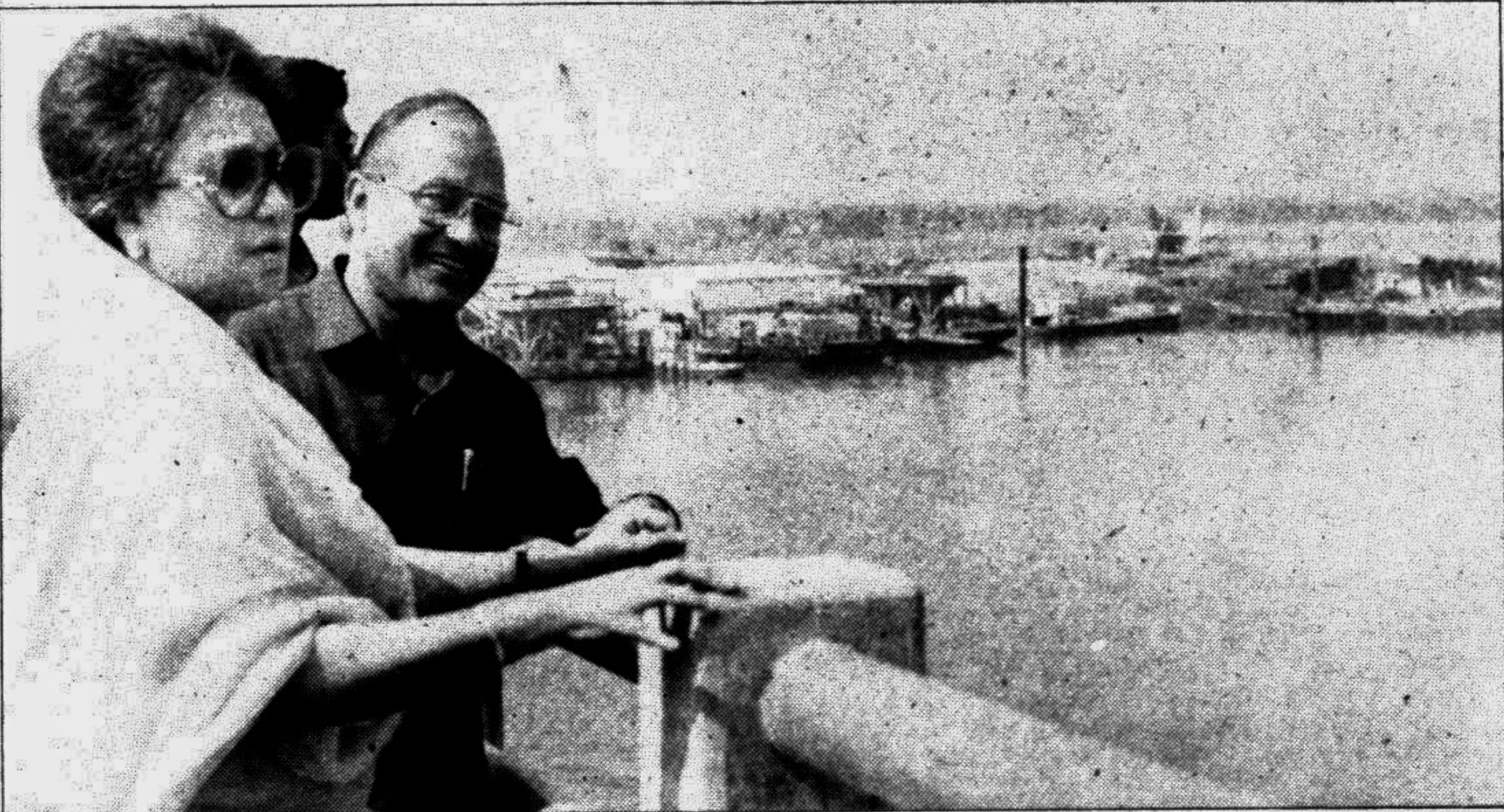
Prime Minister Begum Khaleda Zia, accompanied by Energy Minister Khandaker Mosharraf Hossain, takes a look at the river below from the Meghna-Gumti bridge on the Dhaka-Chittagong highway which she formally opened to traffic yesterday.