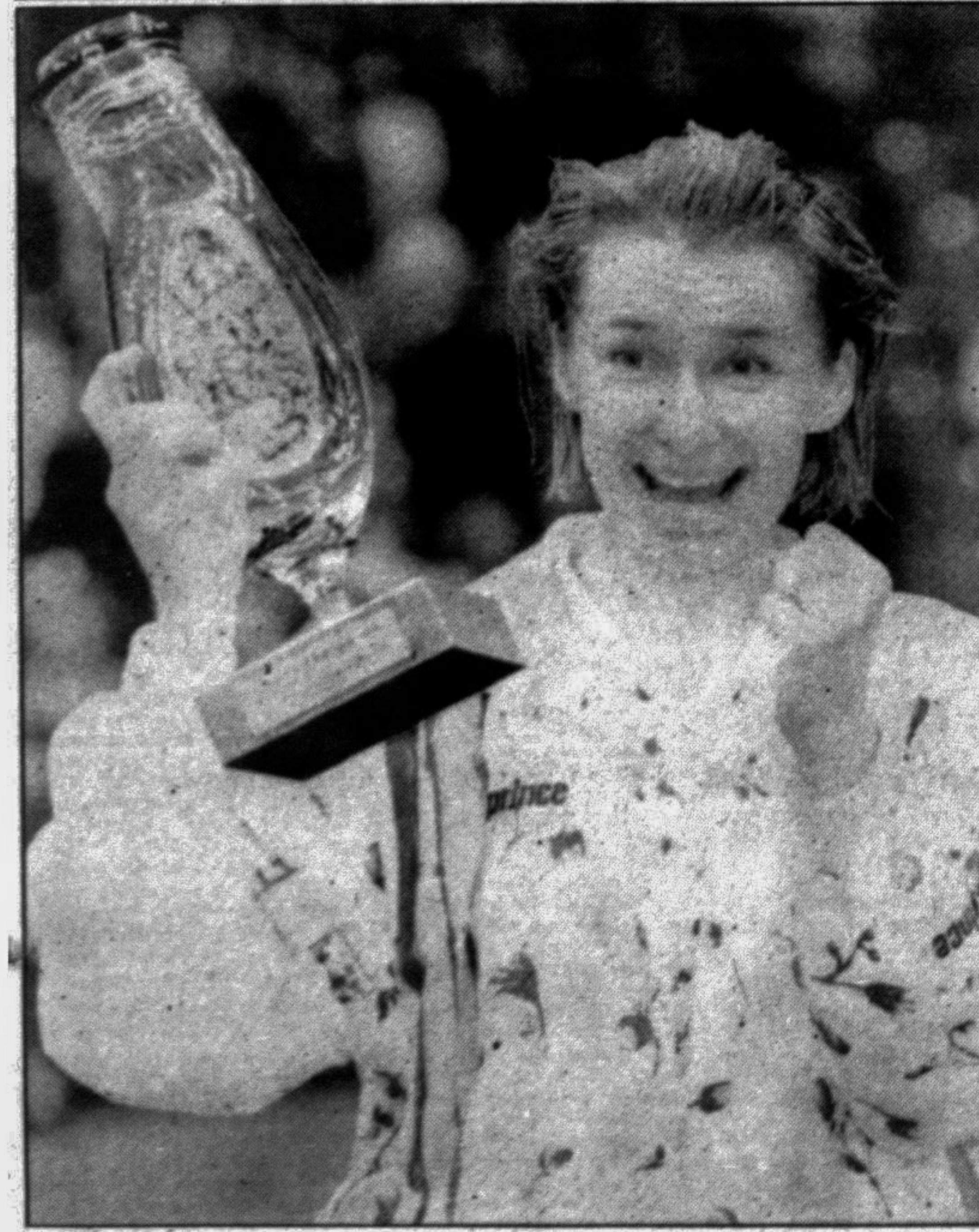
Czech Jana Novotna poses with the trophy after winning the 400,000 dollar WTA Essen international tennis tournament on Oct 30. Novotna beat Croatian Iva Majoli 6-2, 6-4 in the final.

SOTOGRADE, Spain, Oct 31: Bernhard Langer of Germany struggled to an 1-under-par 70 Sunday but won the Volvo Masters by a shot when Seve Ballesteros of Spain bogeyed the last hole, reports AP. Ballesteros finished in a second-place tie with Vijay Singh of Fiji with 7-under-par 277 totals. Colin Montgomerie of Scotland and Miguel Angel Jimenez of Spain shared third another shot back. Langer, who began the round two shots behind Ballesteros, pulled even with the Spaniard when he knocked in an 8-foot putt for a birdie at the par-65 17th hole. Langer parred the 18th, but Ballesteros hit his drive behind a double-trunked tree on the hole and was forced to chip onto the fairway. The Spaniard's third shot ran across the green into a bunker and he took a bogey five.