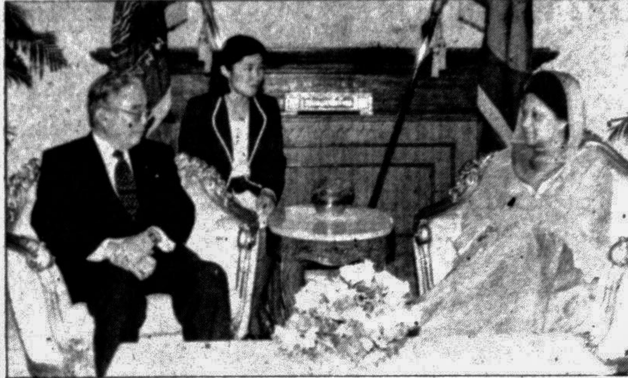
The visiting Japan-Bangladesh Parliamentarians Association president and former Japanese Foreign Minister Hiroshi Mitsuzuka called on Prime Minister Begum Khaleda Zia at her office yesterday.