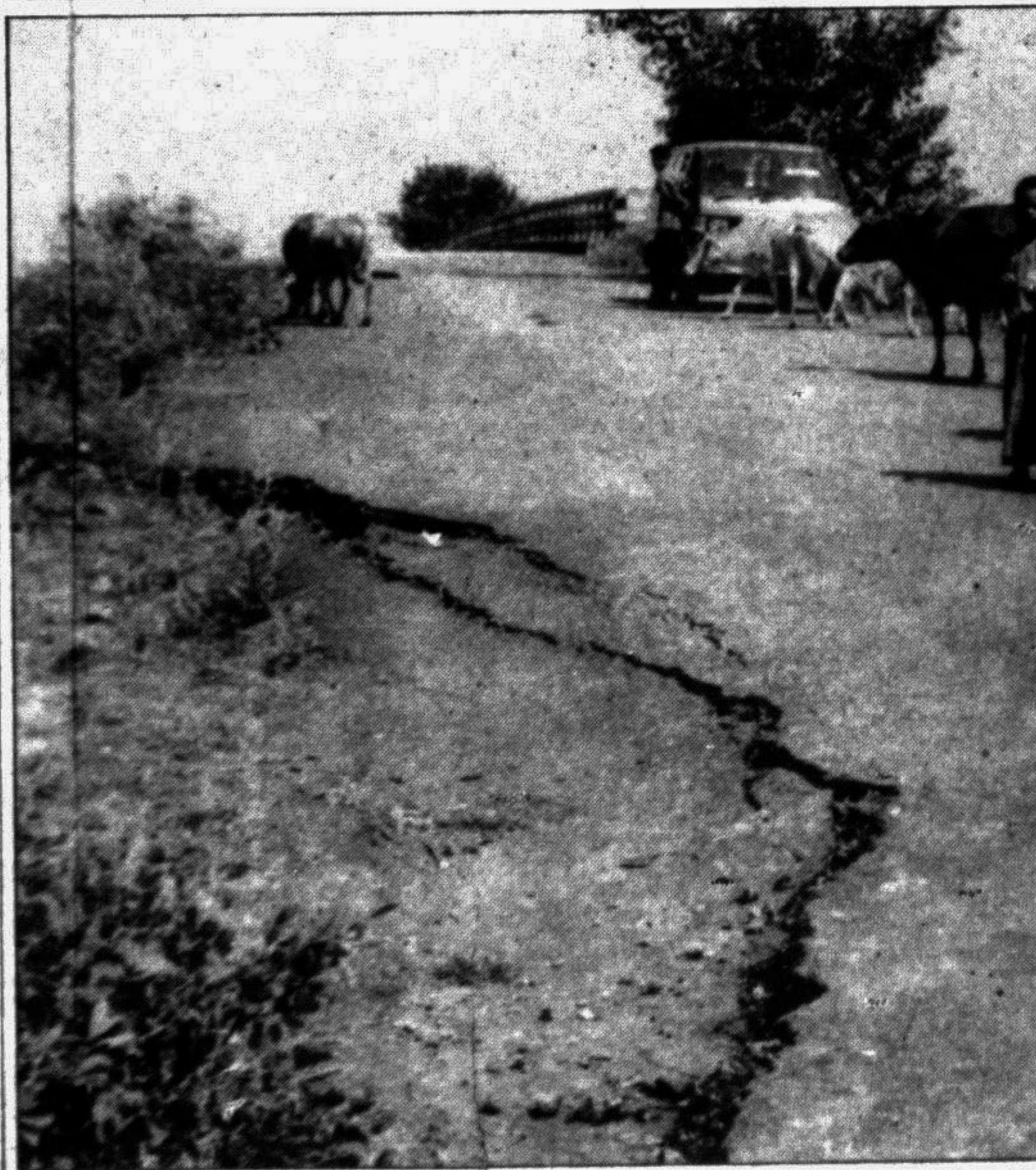
SYLHET: Pitiable condition of Sylhet-Jakiganj road near Julair Pool.

The sufferers urged to the authorities to curb crime by taking proper steps against the miscreants to help restore peace and security of the people.