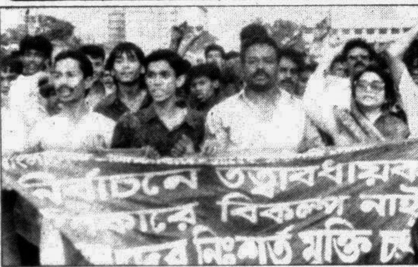
The Jatiya Party brought out a procession in the city yesterday demanding release of the party chief, Ershad, and elections under caretaker government.