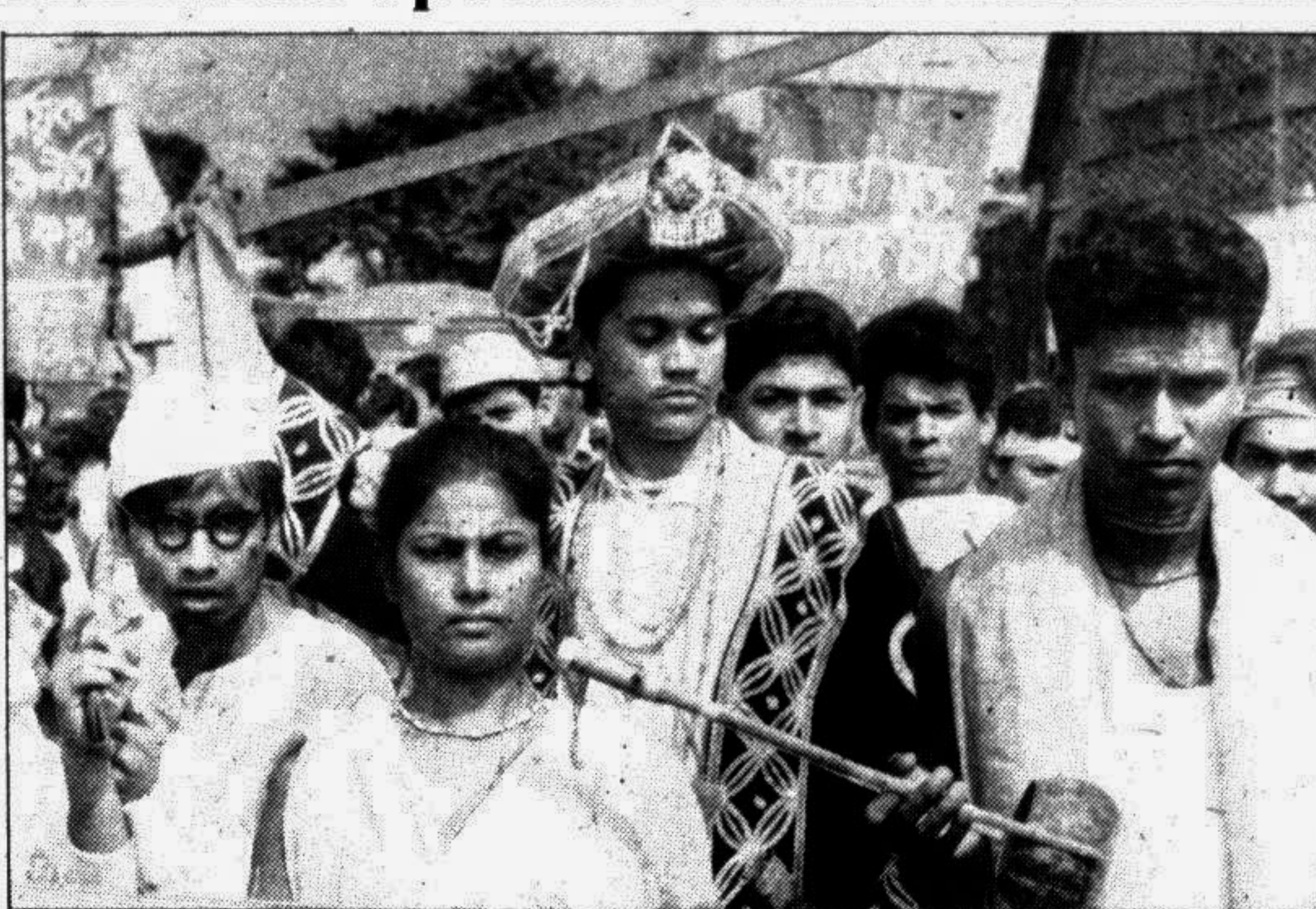
Udichi Shilpi Goshthi, a cultural organisation brought out a colourful procession in the city yesterday to mark its 26th founding anniversary.

May be, it is pertinent here to acknowledge the guidance that Islam gives on the subject. The Koran not only advocates an alms-tax but urges again and again to be steadfast in prayer and regular in charity and warns 'woe to those who make a show of piety and give no alms to the destitute; who are but victims of the social structure. However in the final analysis it must be said that it is upto each individual's conscience and reason as to what they believe is the right way to give.