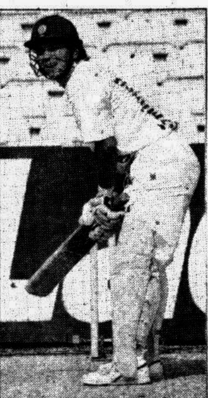
TENDULKAR ... 115 India still needed 23 runs off 25 balls at that stage, but Azharuddin (47 not out) and Vinod Kambli (12 not out) ensured the home team's second successive win in the tournament.

BARODA, India, Oct 28: Sachin Tendulkar returned to form with a brilliant century on Friday as India brushed aside New Zealand in a high-scoring one-day match in the triangular series here, reports AFP. The 21-year-old, who made just eight runs in his last three one-day innings slammed a glorious 115 to help India overtake New Zealand's huge 269 for four with 11 balls and seven wickets to spare. Opening the innings, Tendulkar batted until the 46th over before he was run out when a hard drive from skipper Mohammad Azharuddin was deflected by bowler Dion Nash into the non-striker's wicket.