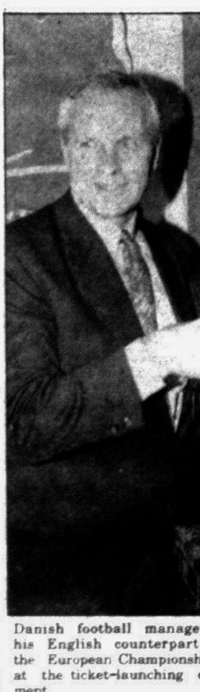
Danish football manager Richard Nielsen (L) and his English counterpart Terry Venables pose with the European Championship trophy in London on Oct 27 at the ticket-launching ceremony for the 1996 tournament.