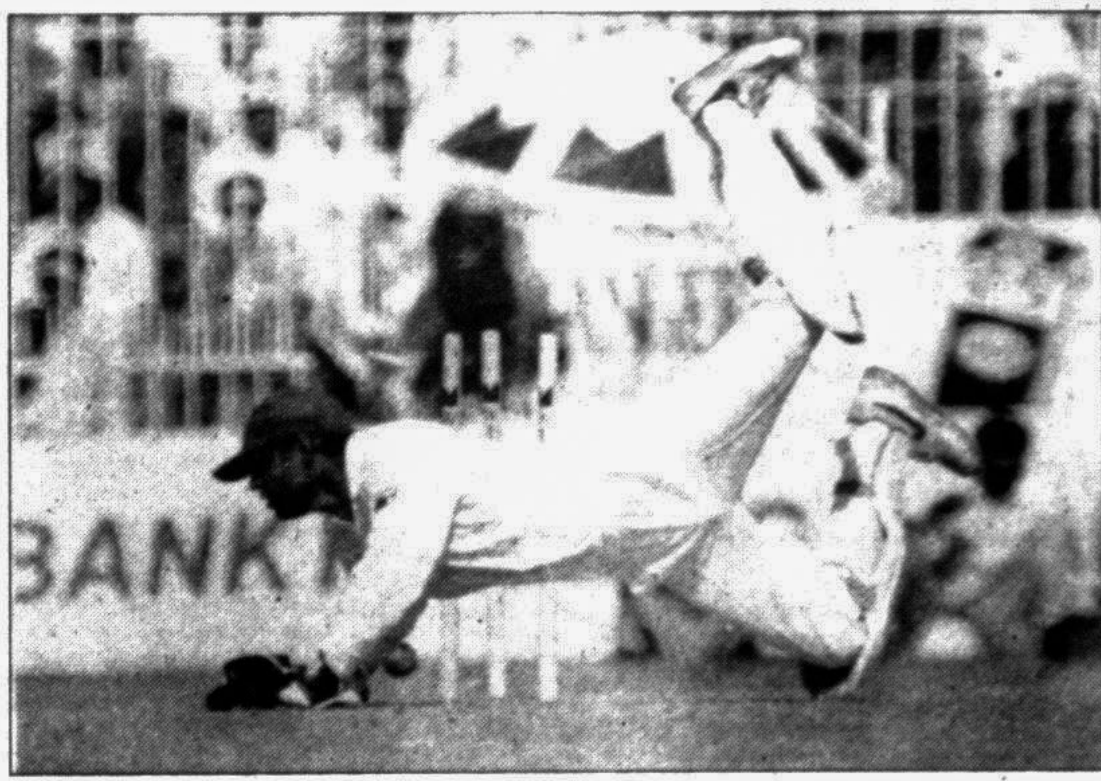
Pakistan wicketkeeper Rashid Latif dives to whip the bails off to terminate South African opening batsman Gary Kirsten's tenure at the wicket during the triangular series match at the Iqbal Stadium, Faisalabad yesterday. Kirsten was run out for 69 and Pakistan won the match by six wickets.