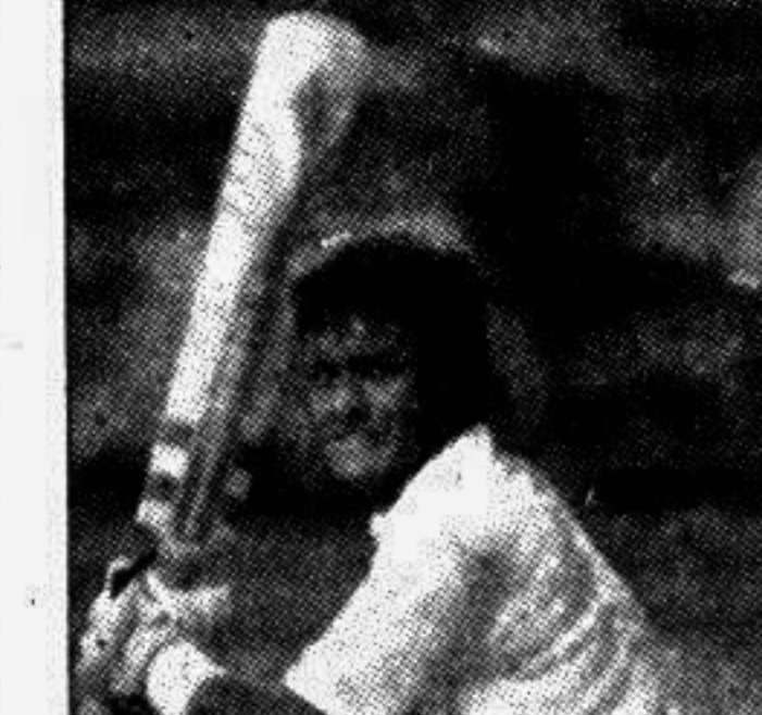
TILLEKERATNE ... 116