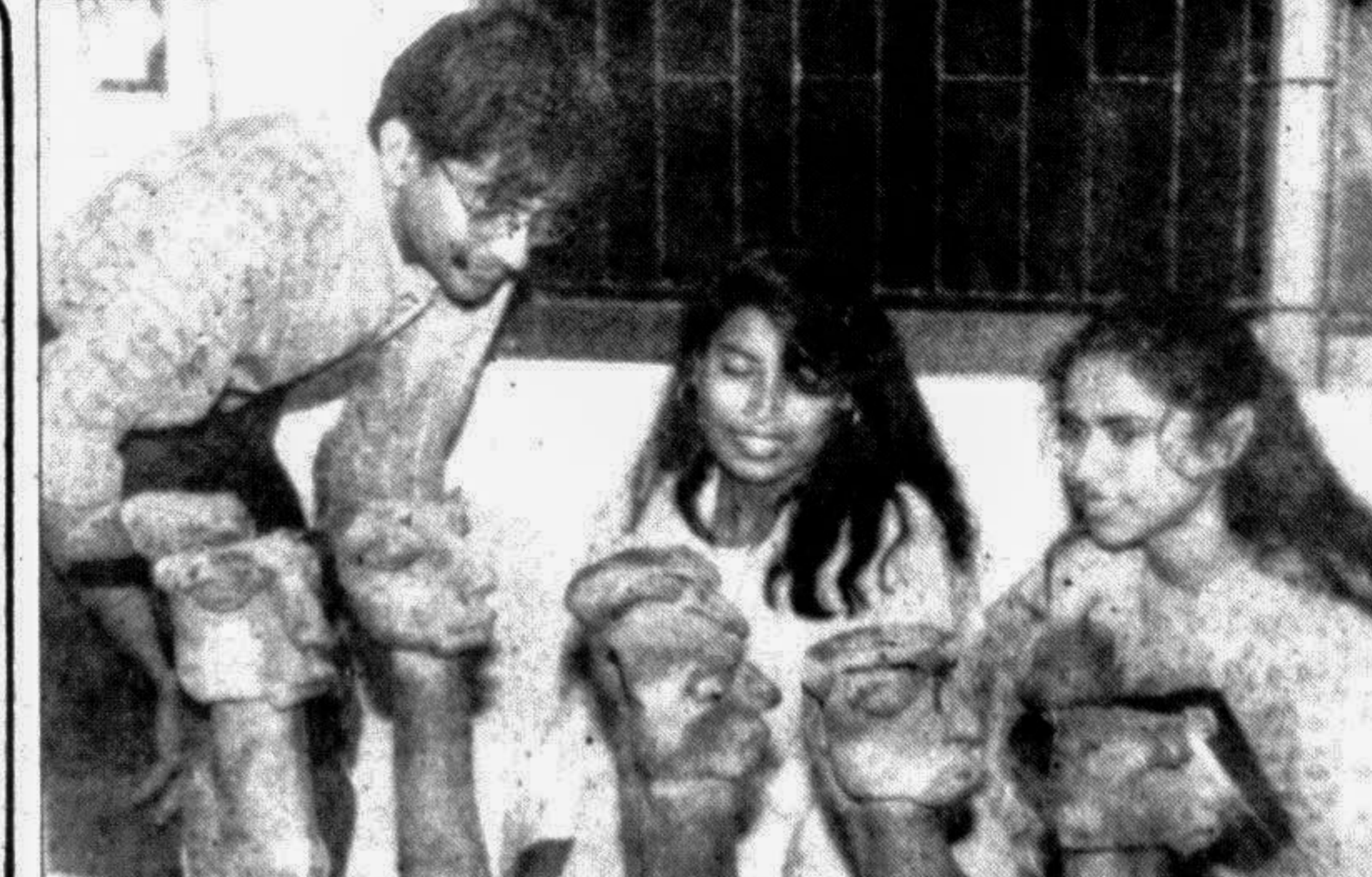
Binnas, a group of five young artists arranged a week-long exhibition at the Gallery Tone in the city yesterday

between the two sides of the (Taiwan) strait is still in the cold war stage. We have to be on alert and prepared for any challenge," Lee said. Defence Minister Sun Chen said the military would not give up one inch of land there. China has refused to rule out an invasion of Taiwan, which it has viewed as a renegade province since the nationalists lost the Chinese civil war and fled to the island in 1949. The possibility that China may try to take Taiwan by force has become a hot topic of discussion on the island in recent months, after a book was published predicting that Beijing would invade in late 1995.