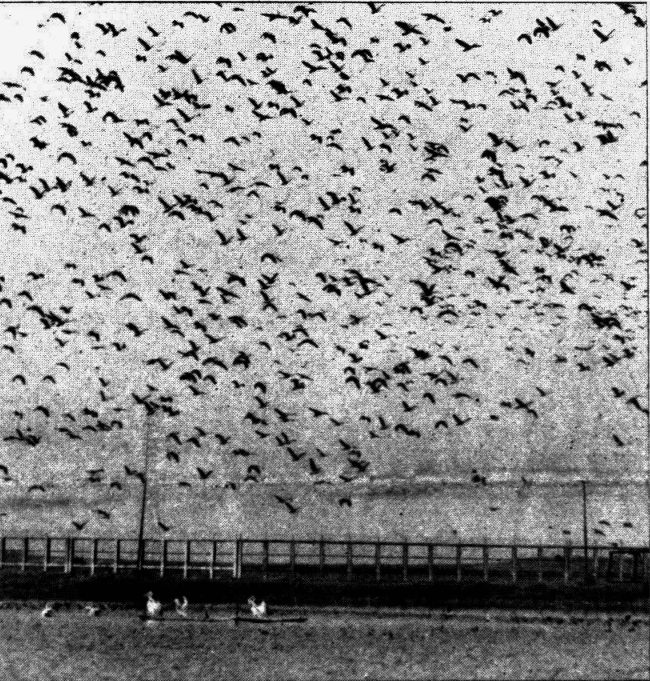
Guest birds, like every year begin to flock at the city's Mirpur Zoo signalling the advent of winter.