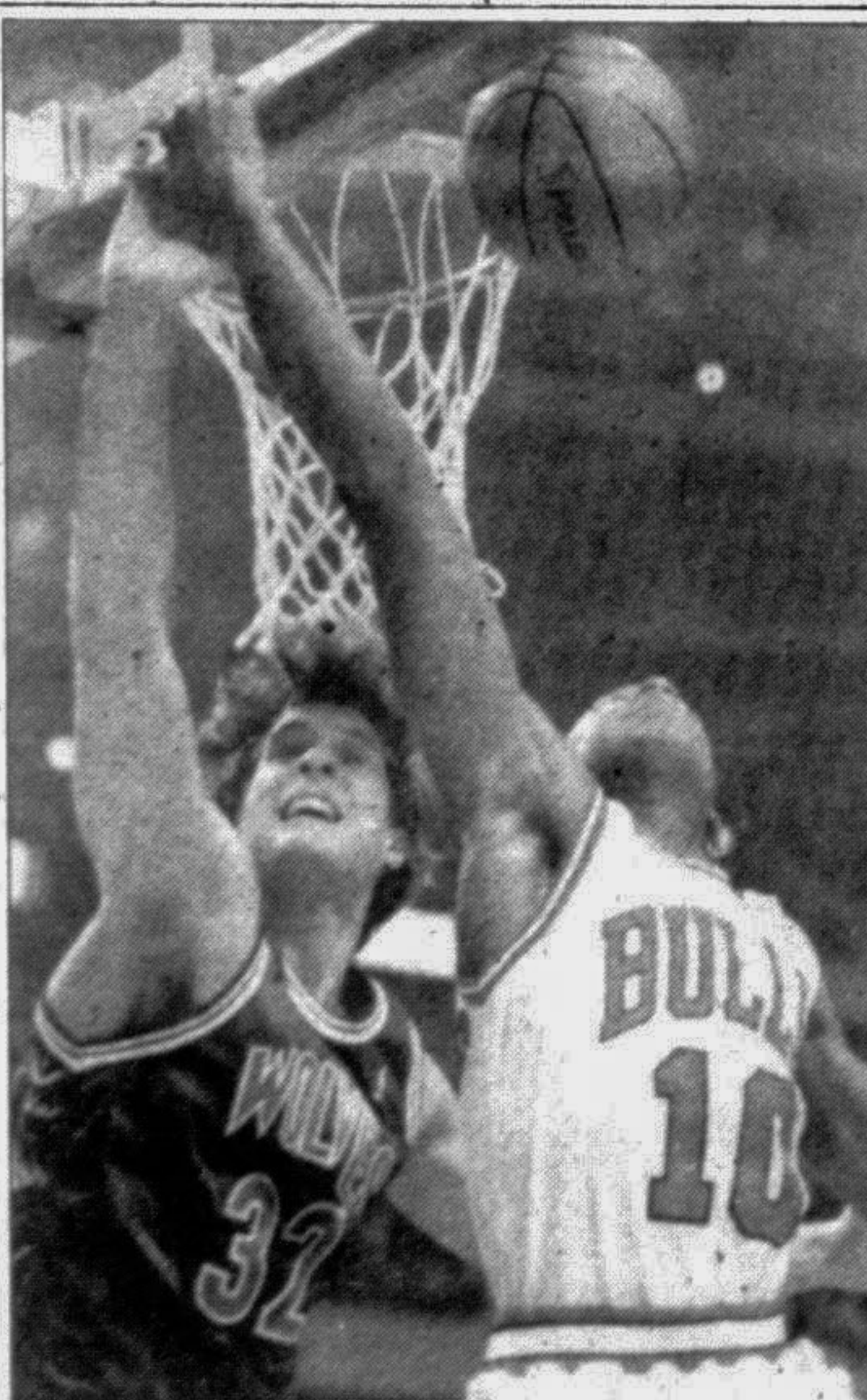
Minnesota Timberwolves forward Christian Laettner (L) has his shot blocked by Chicago Bulls guard B.J. Armstrong during their pre-season game at the United Centre in Chicago on October 25.