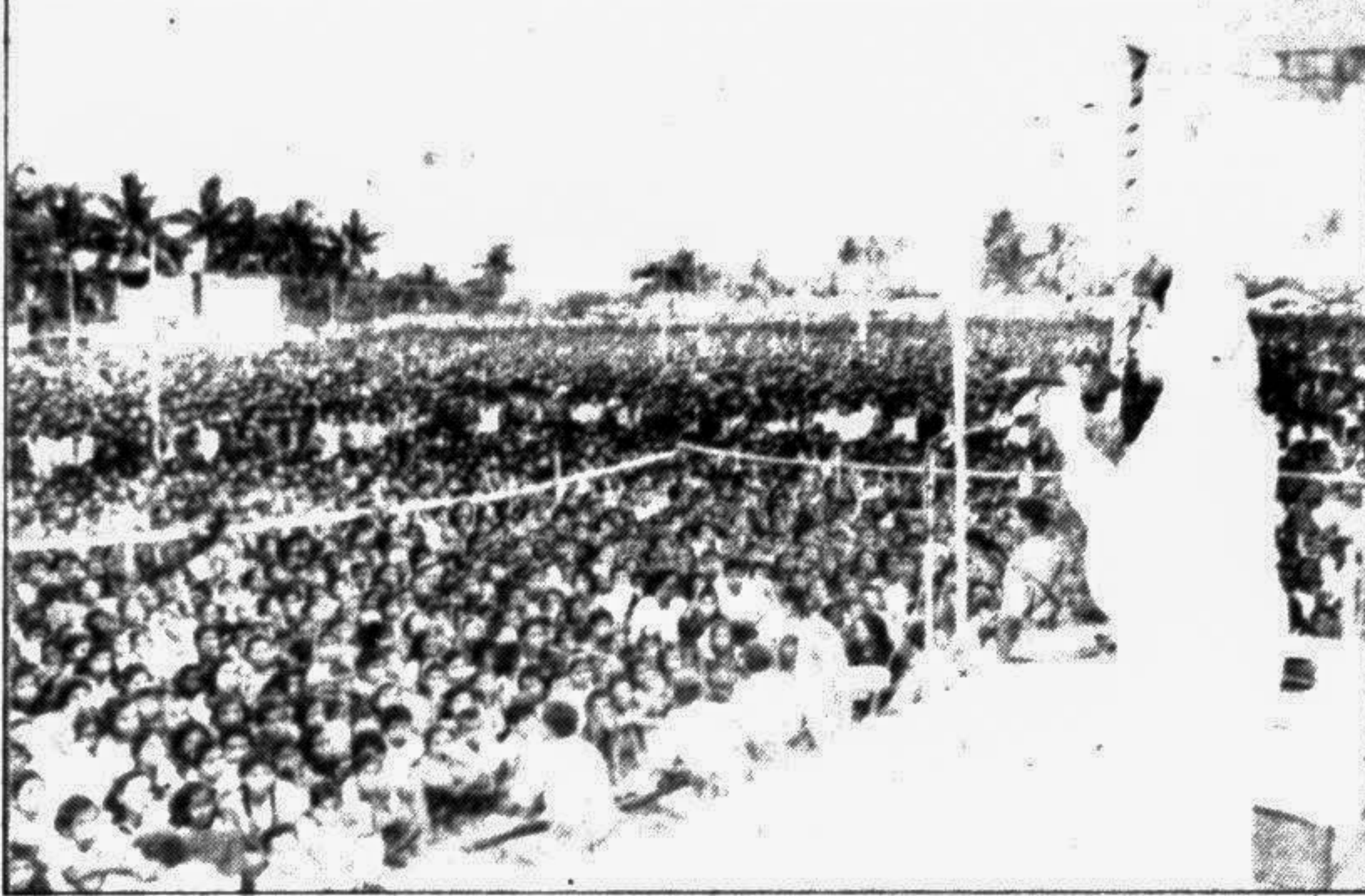
Prime Minister Begum Khaleda Zia addressing a public meeting at the Hatgopalpur High School ground in Jhenidah yesterday.