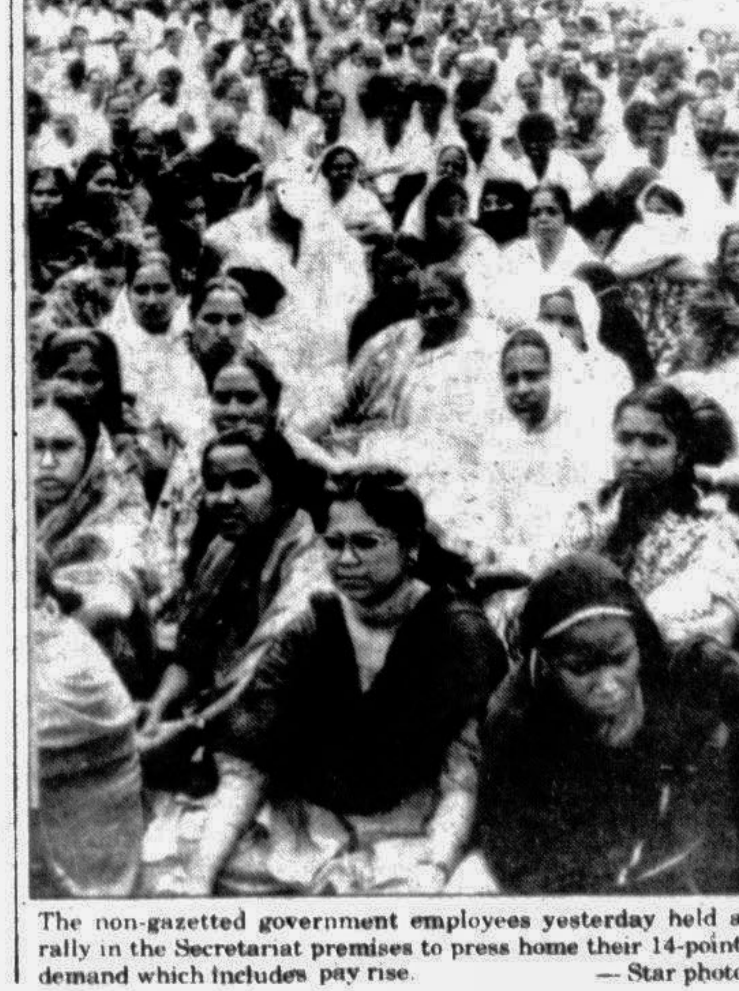
The non-gazetted government employees yesterday held a rally in the Secretariat premises to press home their 14-point demand which includes pay rise.