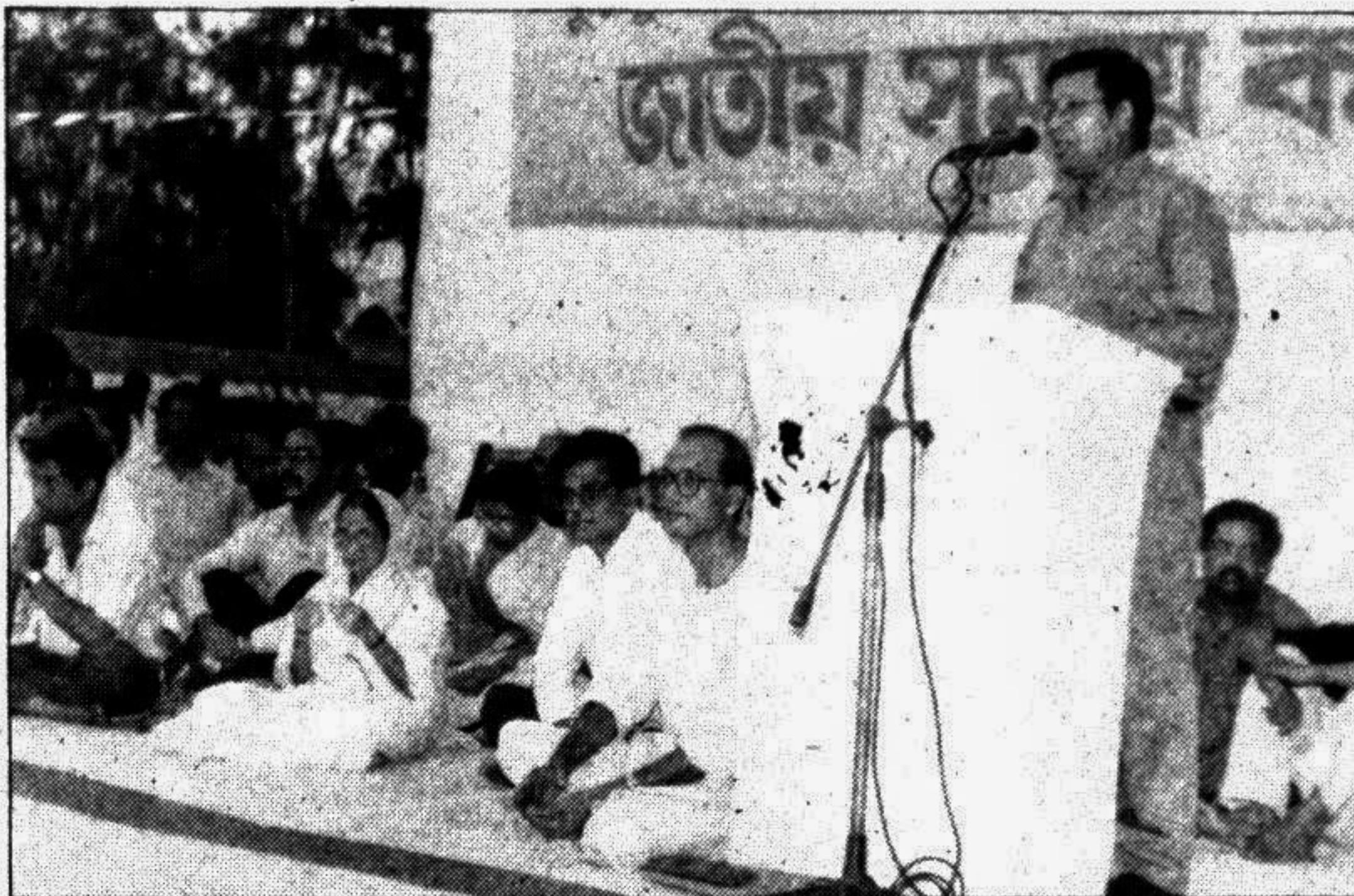
Ghatak Dalal Nirmul Jatiya Samannaya Committee held a rally in front of the Taher auditorium in the city yesterday.

However there are causes to be wary. It is better to make the most of what is left because it's changing all too rapidly. Those who visit from the West are often quite disturbed to see the extent of cultural imposition, done quite unnaturally, on the East. In the face of such global conformation, as we are witnessing today, defeatism and pessimism are killers of cultures. It is all too easy to yield to the new imperialism. It has been designed to be too easy, to appeal to the most basic instincts for comfort and security through material possessions. But a strong and affirmative vision is required for the future. Don't be a party to the murder of your own culture.