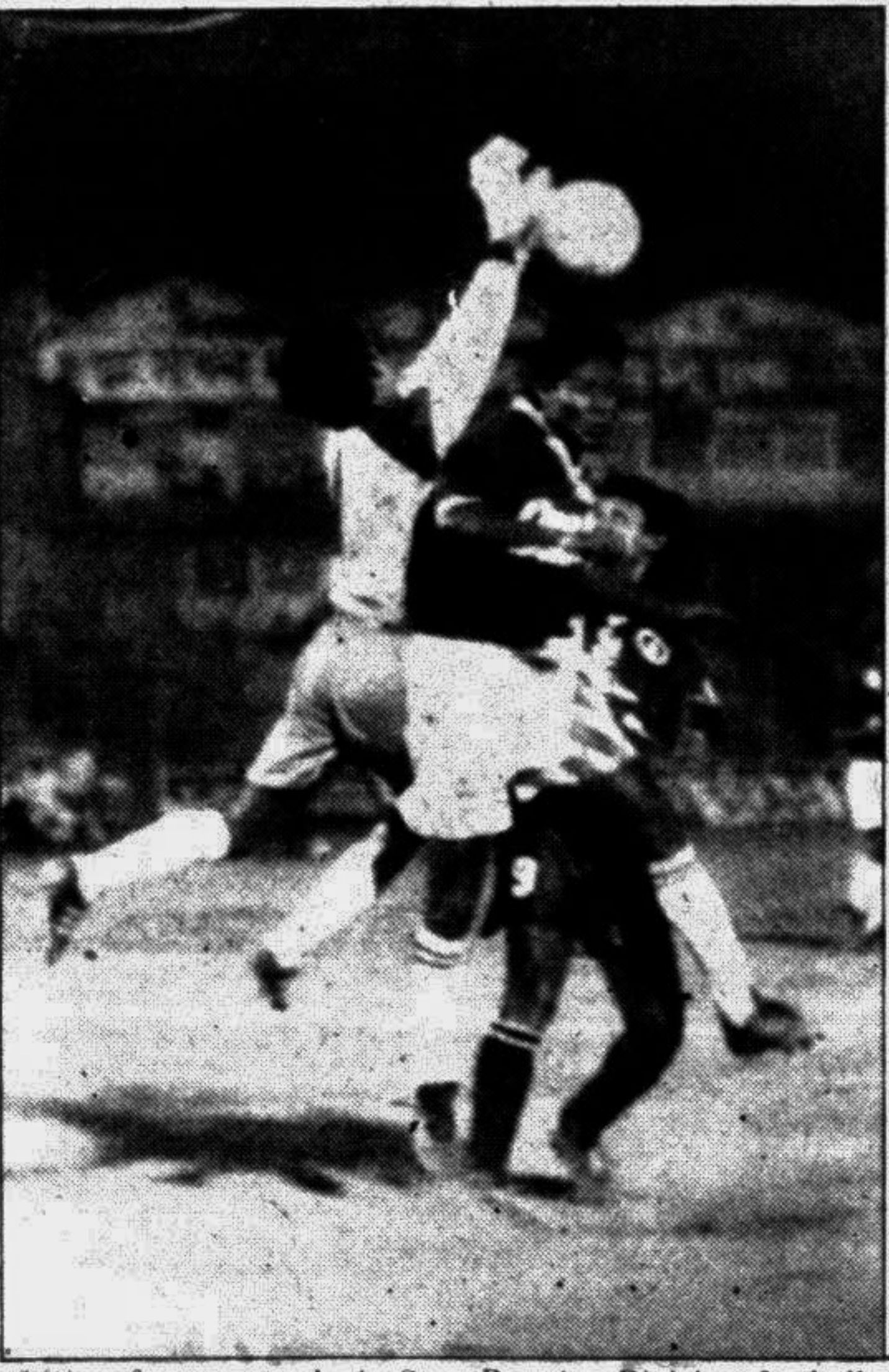
Action from yesterday's Star Premier Division football league encounter between Mukti Jodha Sangsad and Arambagh at the flood-lit Dhaka Stadium. The match ended in a 2-2 draw.