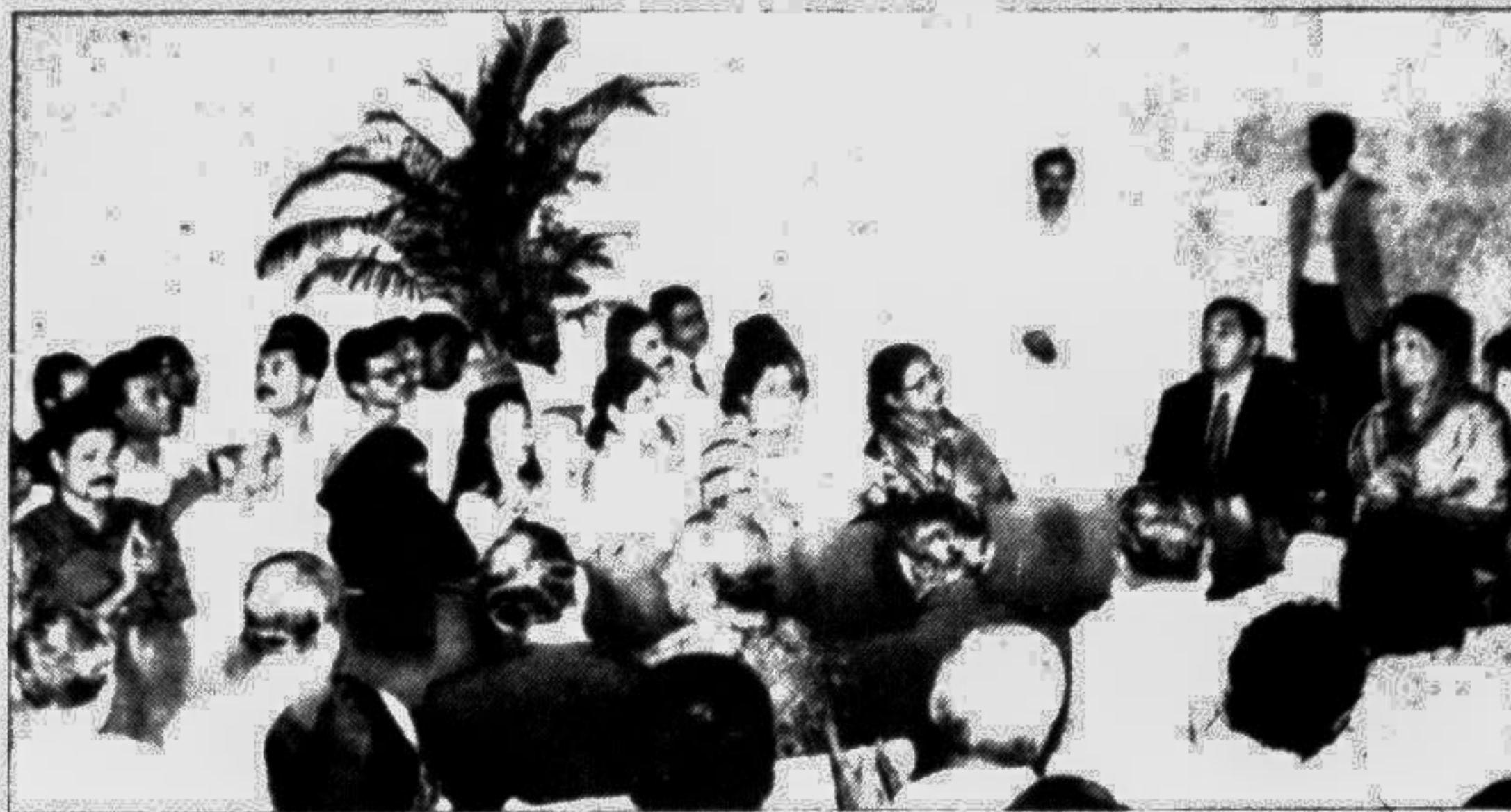
Prime Minister Begum Khaleda Zia exchanging views on various local and national issues with a delegation from the Gulshan, Cantonment and Uttara areas of the city which called on her at her Hare Road office yesterday.

The above suggestions can be, with good management, the ways out of the dismal evenings of city life. Some observers feel after seeing the crowd at Baisakhi Mela (Bengali New Year's Fair) and Ekushey Bot Mela and other fairs that the city dwellers will greatly appreciate such measures to shake off their evening blues.