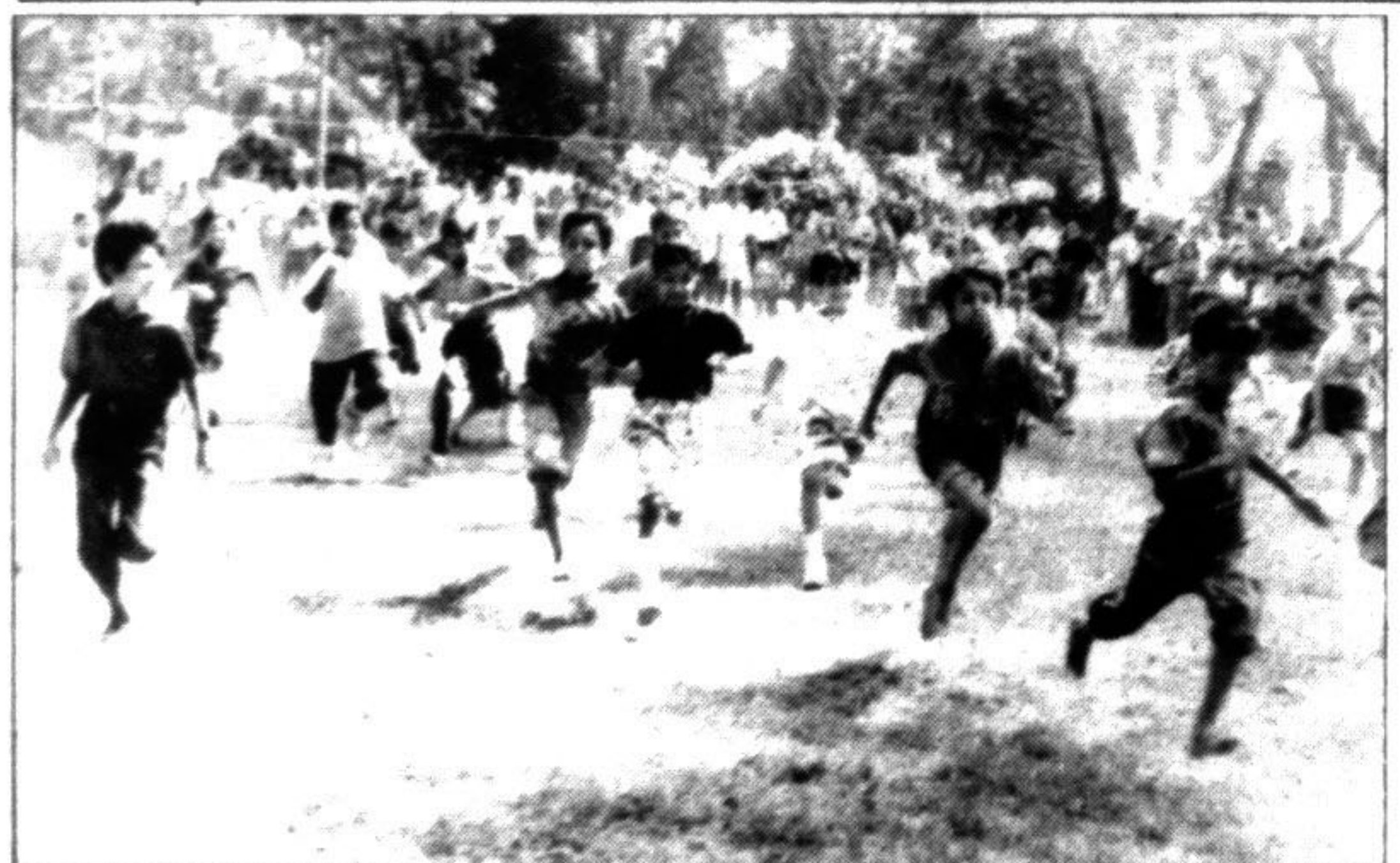
Youngsters in action during a 100 metres race on the concluding day of a three-day sports event marking the 40th anniversary of the Jatiya Press Club at the club's premises yesterday.

The young Ukrainian now faces Australian Davis Cup player Patrick Rafter who scored a 6-3, 6-4, win over Switzerland's Jakob Hlasek.