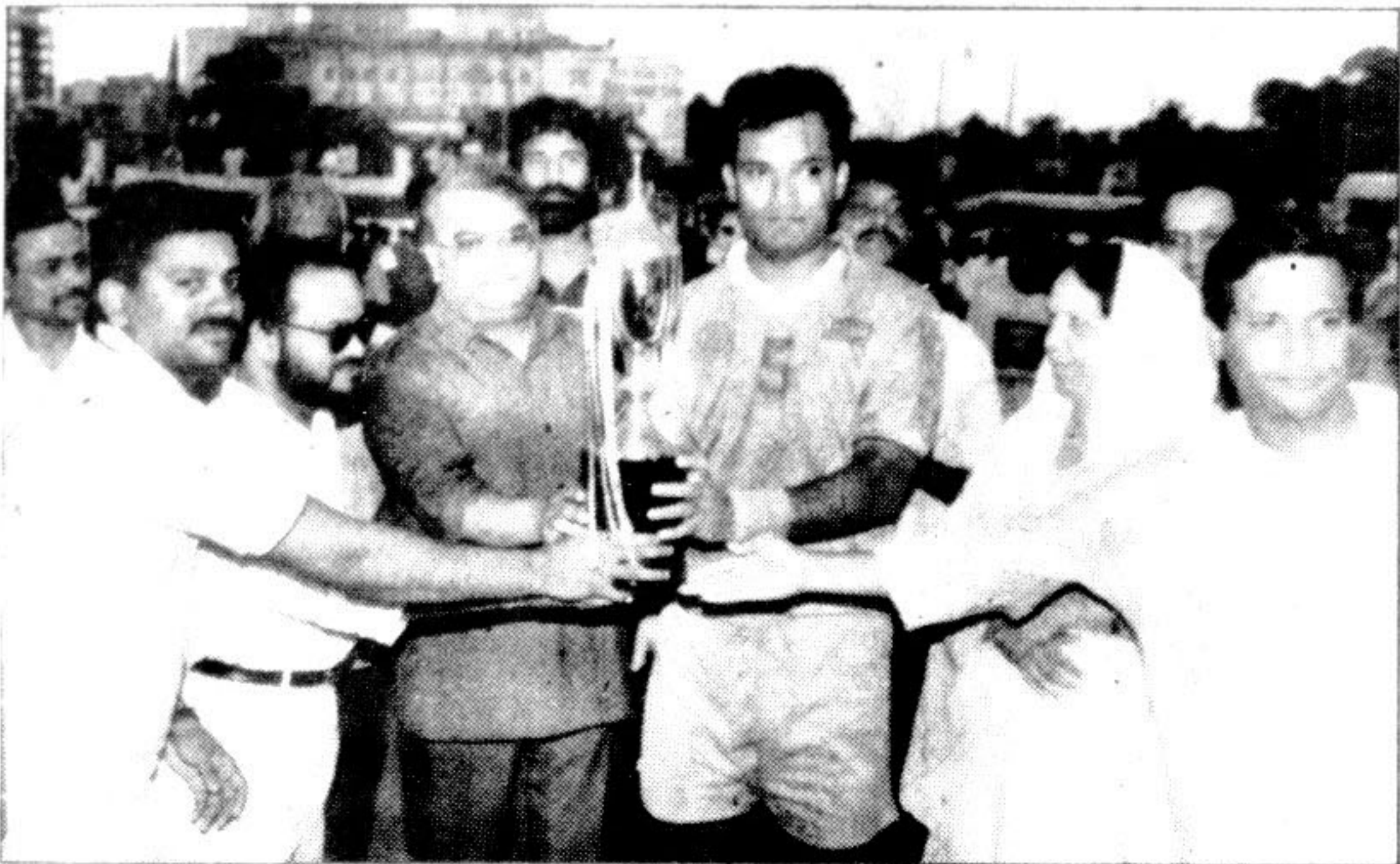
Information Minister Barrister Nazmul Huda giving away the trophy to Brothers Union captain after the final of the MA Khan Memorial tournament yesterday. Brothers beat Ansars 17-14.