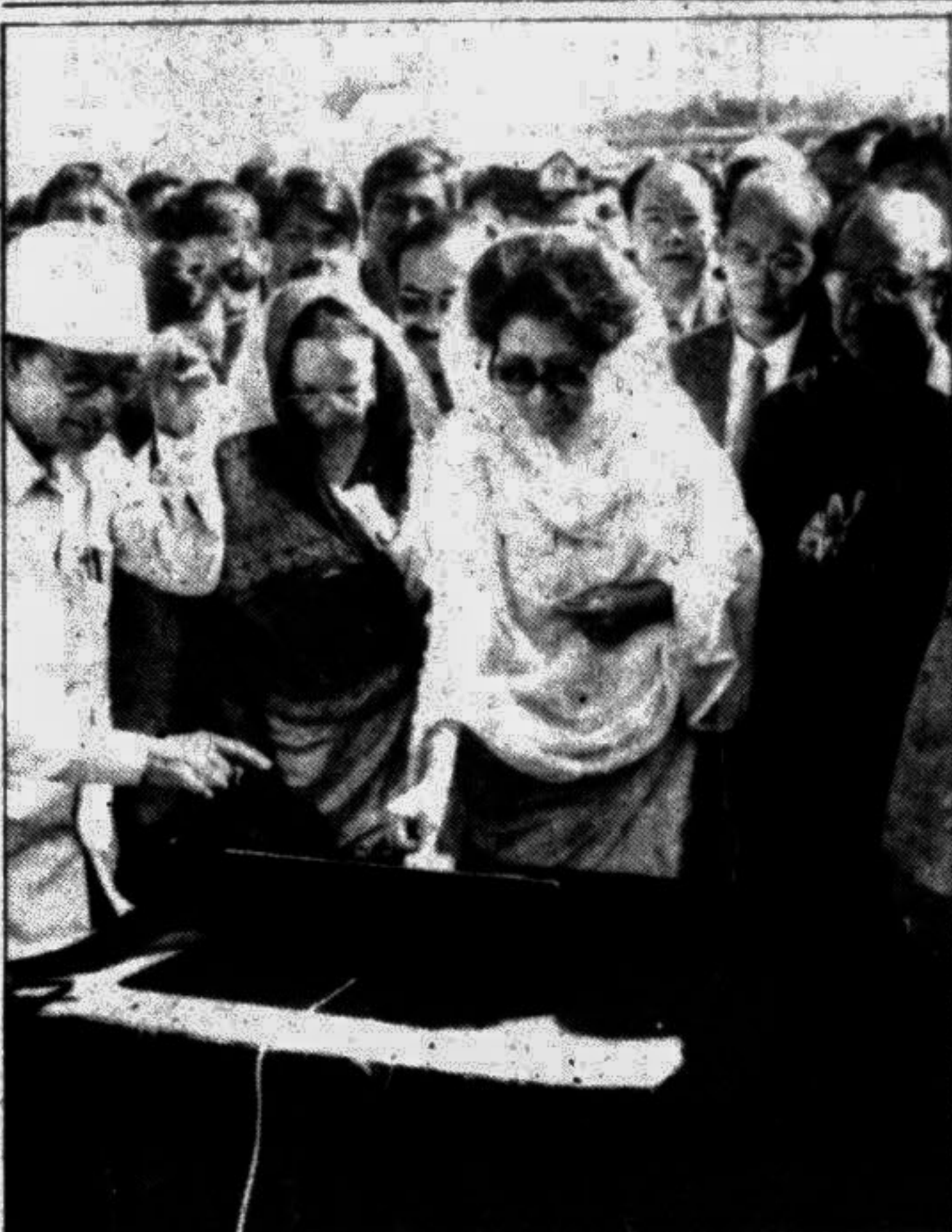
Prime Minister Begum Khaleda Zia inaugurating boring shafts at the Madhyapara Hardrock Project in Dinajpur district yesterday.