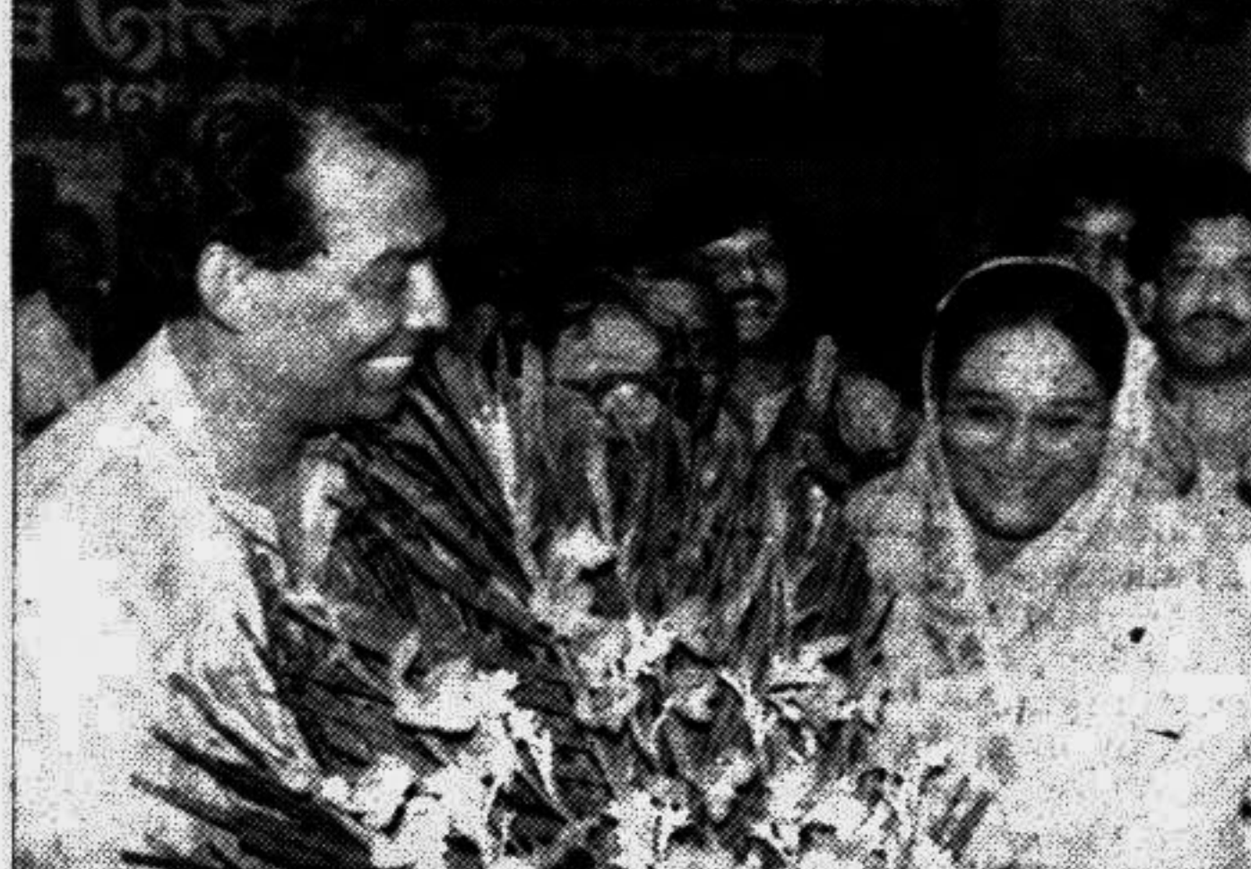
Suranjit Sengupta, MP presenting a bouquet to Awami League chief Sheikh Hasina at the Ramna restaurant in the city yesterday marking the formal merger of his now-defunct Ganatantri Party with the Awami League.

A meeting of the chief ministers of the northeastern states would be held at Shillong on October 28 to discuss the issue and the Union Minister of State for Internal Security, Rajesh Pilot, was scheduled to attend.