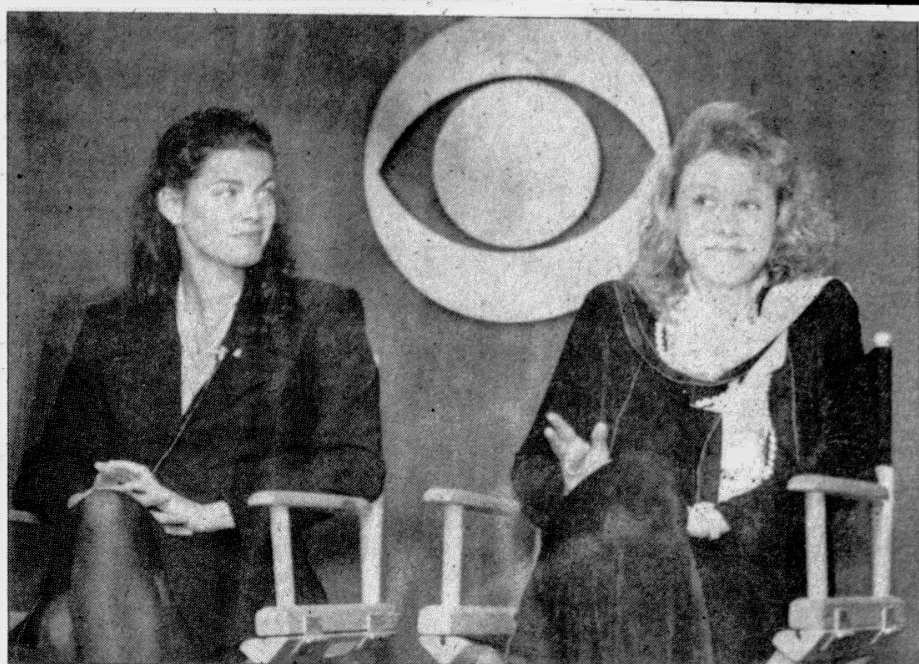
Lillehammer gold medalist Oksana Baiul (R) and silver medalist American Nancy Kerrigan take questions during a press conference in New York on Oct 17 to announce "Ice Wars: The USA vs The World" on Nov 9. Two teams led by Kerrigan and Baiul will play each other in the two-day challenge.