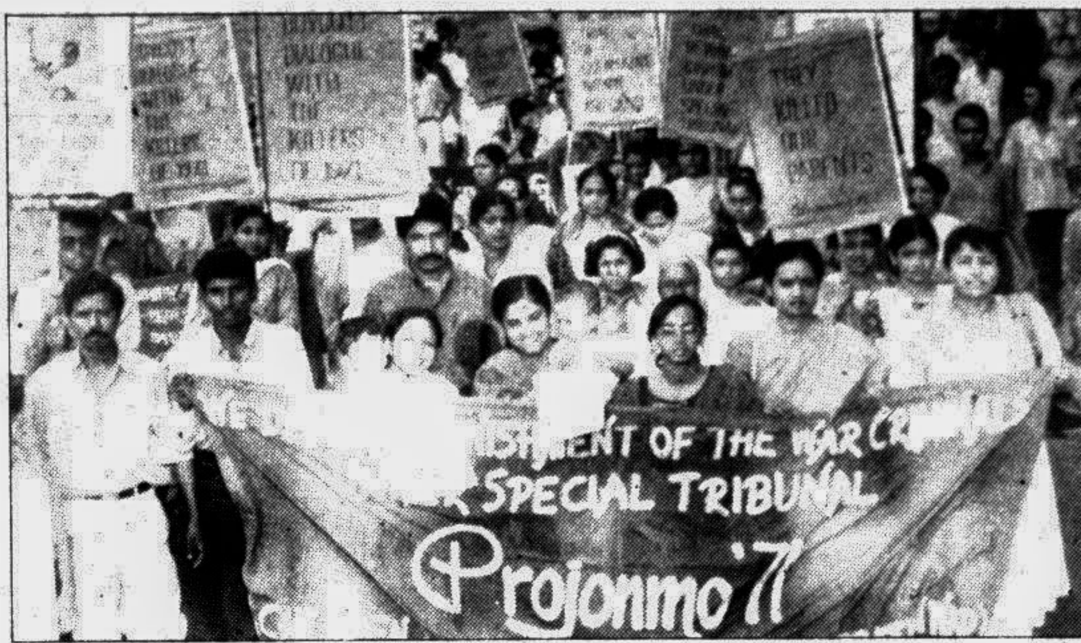
Projonmo 71, an organisation of children of the Liberation War martyrs, brought out a procession in the city yesterday. It submitted a memorandum to the Commonwealth envoy, Sir Ninian demanding exclusion of the war criminals from the dialogue.