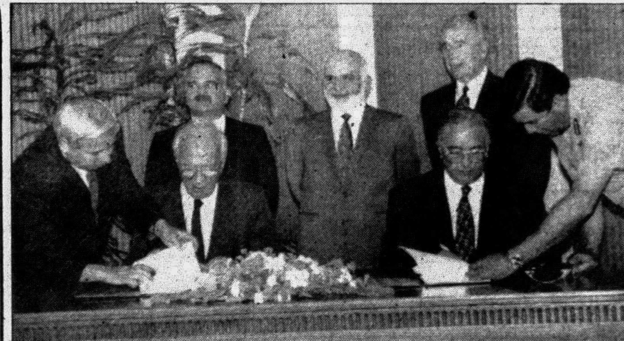
Jordanian Prime Minister Abdel Salam Majali (R) and Israeli Prime Minister Yitzhak Rabin are helped by aides while initialising a peace treaty which will be signed next week. Standing behind during the ceremony at Amman's Al-Hashimieh Palace Monday are King Hussein (C), Jordanian Crown Prince Hassan and Israeli Foreign Minister Shimon Peres.