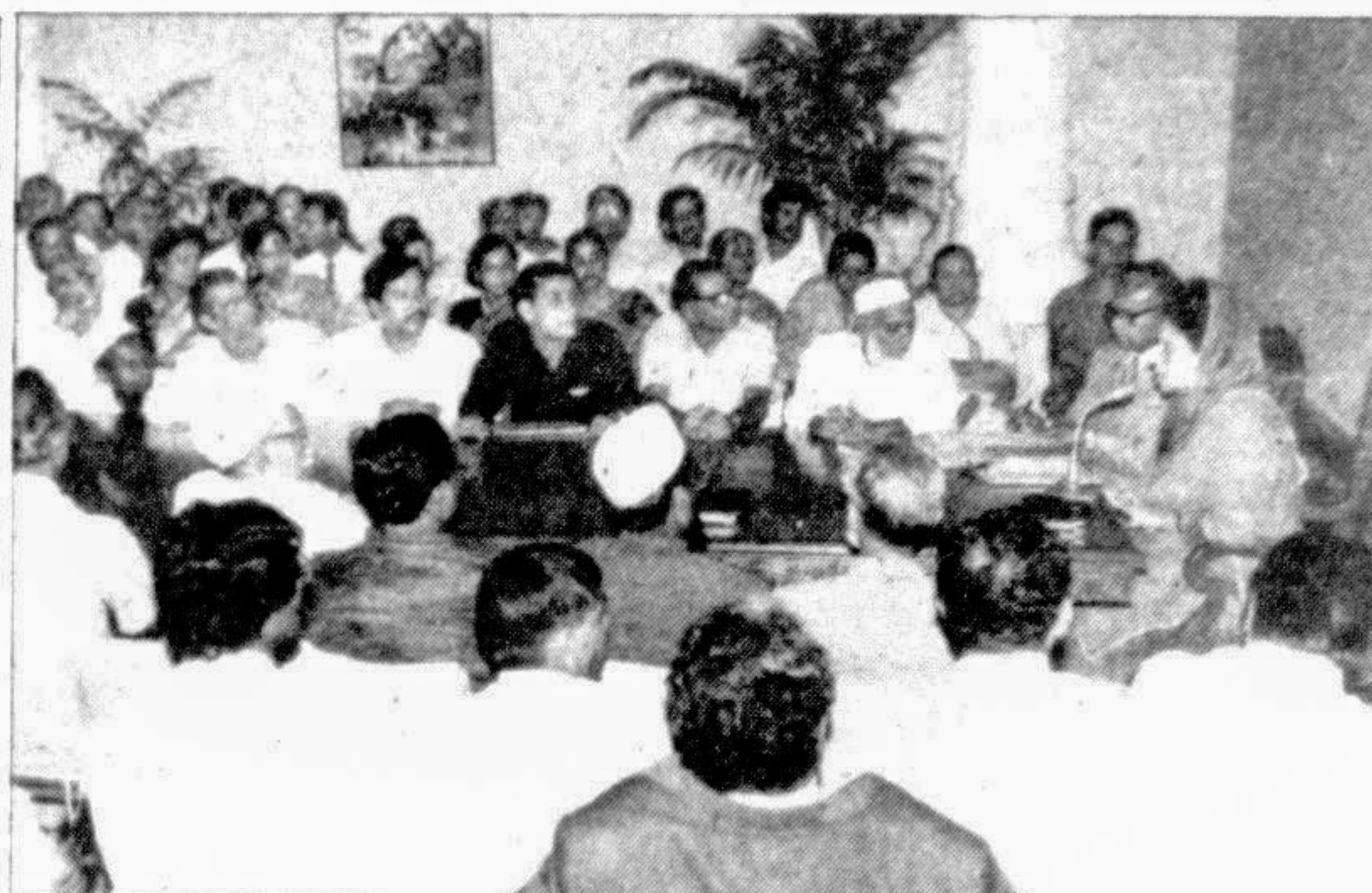
Elite of Dhanmondi and Mohammadpur areas of the city discussed local problems and different national issues with Prime Minister Begum Khaleda Zia when they called on her at the Hare Road office yesterday. Education Minister Jamiruddin Sircar is seen on her right.