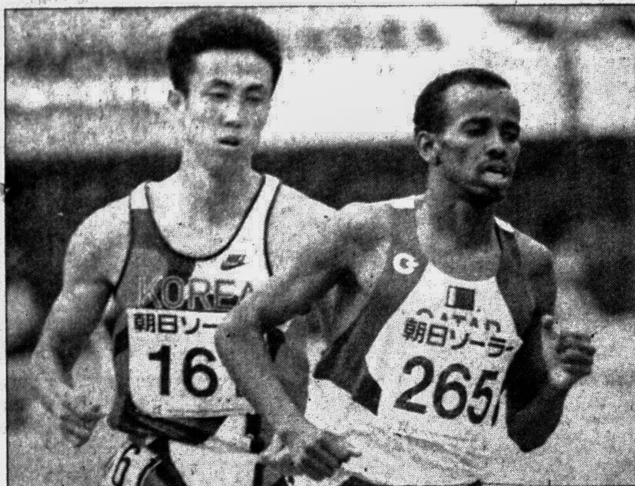
Qatar's Ahmed Sulaiman leads South Korea's Lee Jin Il during the men's 1,500 final in the 'Big Arch' stadium yesterday. Sulaiman finished the race in a time of 3m 40.00 seconds setting a new Asian Games to win the gold.