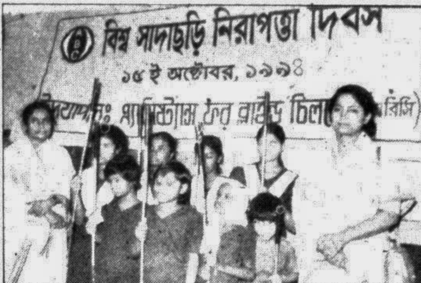
Members of the Assistance for Blind Children (ABC) hostel seen here with the ABC authorities and participants in a discussion on the occasion of World White Cane Safety Day held at the ABC head office in the city yesterday.

Actually most of the addabj students often come from well-to-do families. And usually they are the residents of the proverbial hotel, namely Babar hotel, so they needn't worry much about anything. But their mistake is that sometimes they are too carried away by addas to forget about the exams coming their way. As a result, many have to compensate by losing academic years. Most people realise that it is a heavy loss. But do these students realize the same?