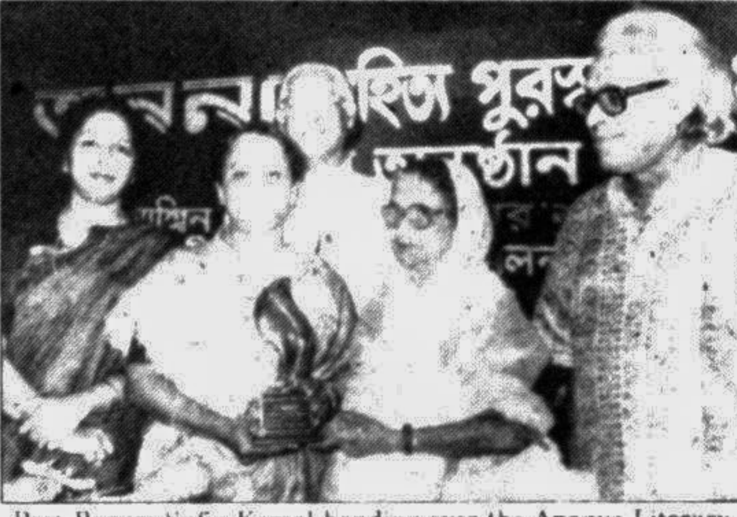
Poet Begum Sufia Kamal handing over the Ananya Literary Award 1401 BS to writer Selina Hossain at the National Museum auditorium in the city yesterday. Poet Shamsur Rahman (R) is also seen. Ananya, a vernacular fortnightly for women, sponsored the award.

5:30 Opening of session 5:40 Bible recitation 5:45 Desh O Bigyan 5:50 News in Bangla 5:55 Cartoon film: Tom and Jerry Kids Show 6:00 Sports programme 6:05 Health programme: Apnar Daktar 7:00 Open University 7:25 Tagore songs 8:00 News in Bangla 8:30 Business programme: Taka Ana Kar 9:00 Drama series: The Sword of Tipu Sultan 10:00 News in English 10:30 Musical programme: Shur Lahori 11:30 Khabar/The News 11:45 Closing