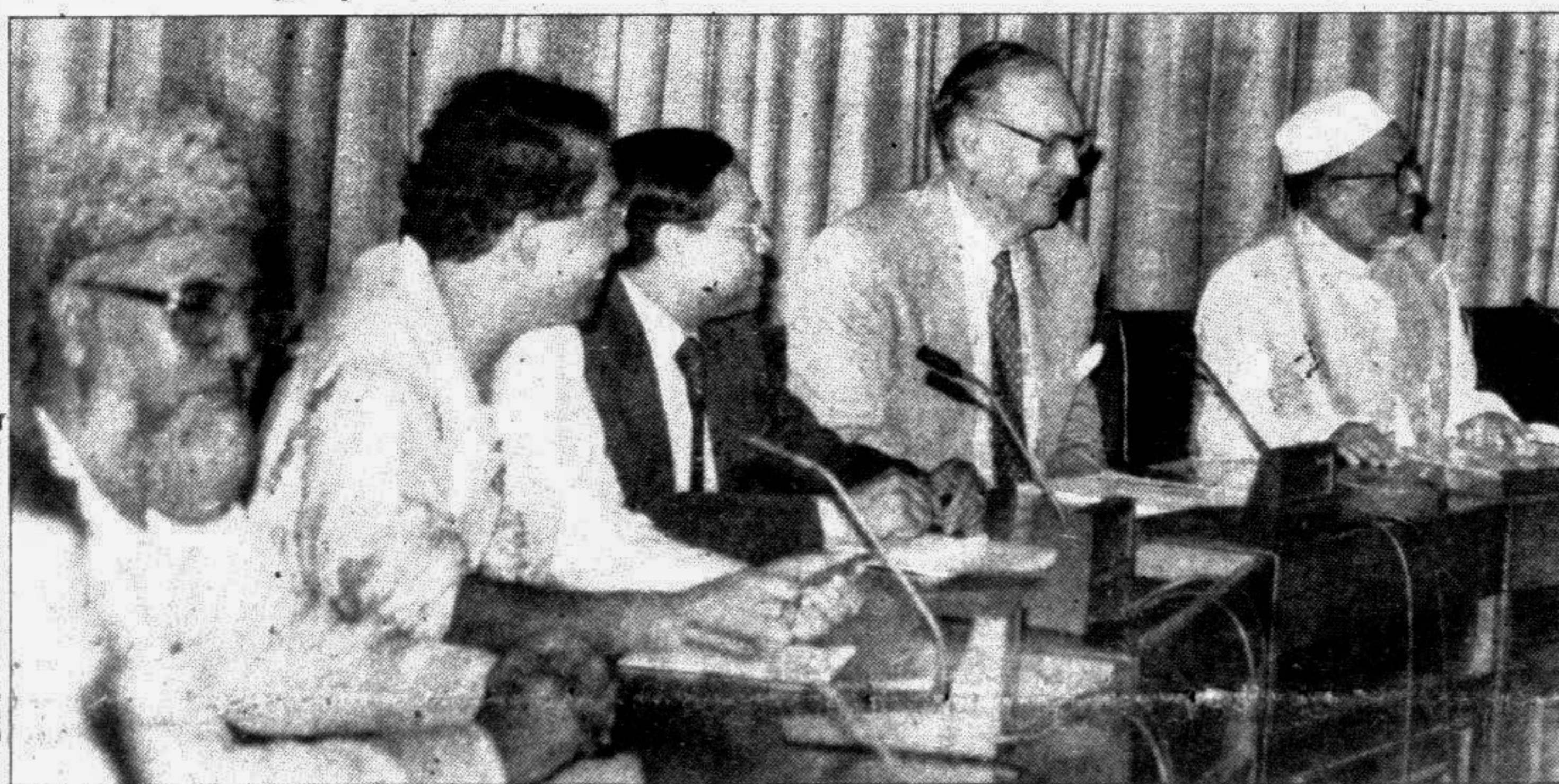
Commonwealth emissary Sir Ninian Stephen (2nd from R) met the opposition leaders at the Sangsad Bhavan yesterday. Also seen (from L-R) are Matiur Rahman Nizami of the Jamaat-e-Islami, Suranjit Sengupta of the Ganatantri Party, Moudud Ahmed of the Jatiya Party and Abdus Samad Azad of the Awami League.