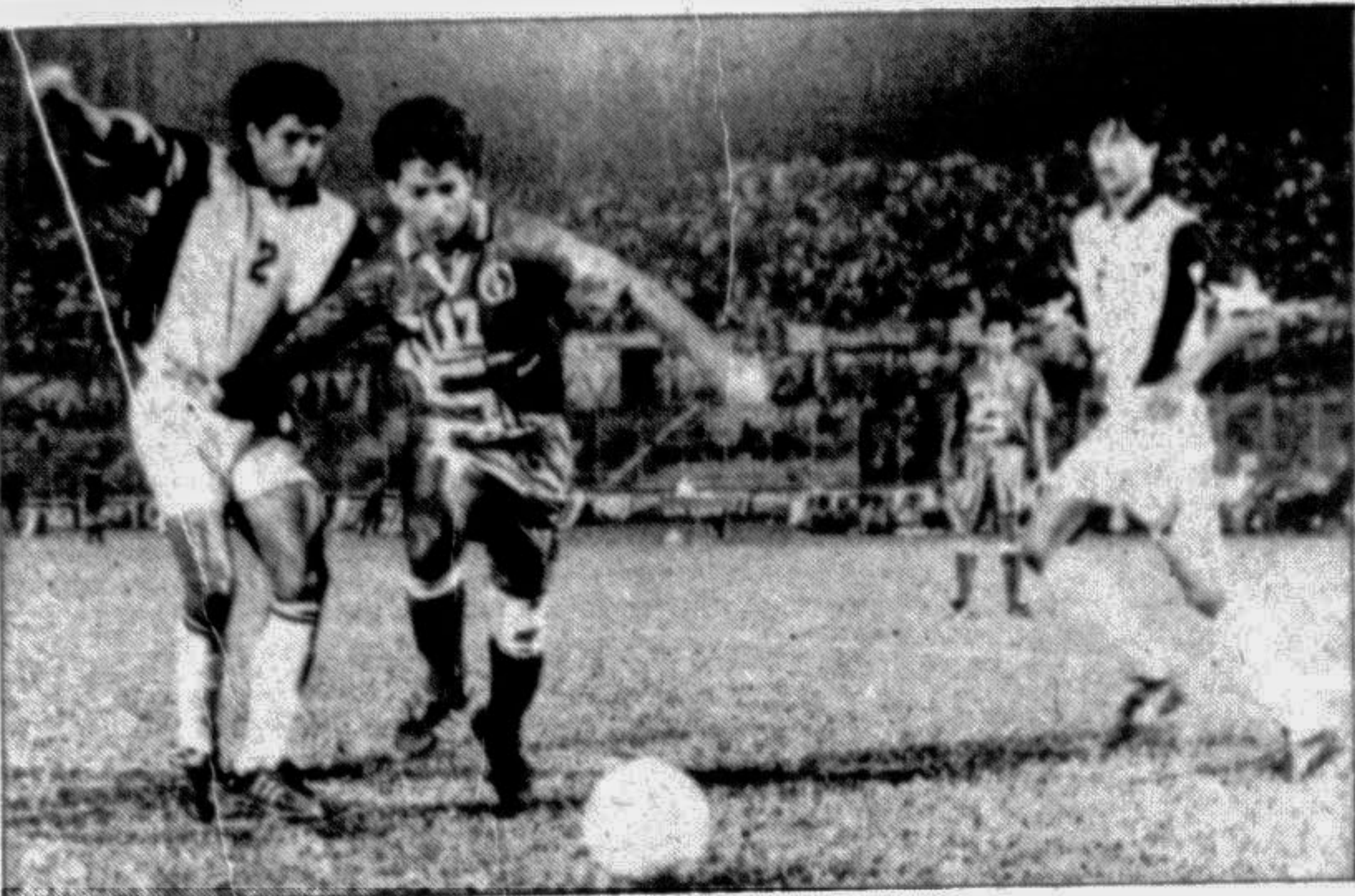
A midfield tussle from yesterday's crucial Star Premier Division football league encounter between Mohammedan Sporting Club and Muktiyoddha Sangsad at the Dhaka Stadium yesterday. Mohammedans won one-nil.