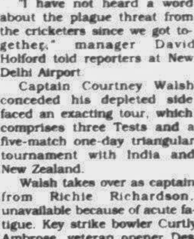
Captain Courtney Walsh

Walsh takes over as captain from Richie Richardson, unavailable because of acute fatigue. Key strike bowler Curtly Ambrose, veteran opener Des Haynes and pace bowler Winston Benjamin will also miss the tour. "This tour is of paramount importance," Walsh said. "We will miss the experience of the stalwarts but this is the opportunity for the youngsters to make their mark." "We have some fine cricketers as replacements for them. By the time the Test matches are around these boys would be fine-tuned." Walsh said his team's strength lay in the players' ability to switch from one-day cricket to Test matches. The West Indies arrived from London without Brian Lara, who missed the flight. Walsh said he hoped to see his vice-captain in the next 24 hours. The West Indies were to leave in the evening for the north Indian city of Chandigarh. They play their first game on Friday, a limited overs practice match against a team led by former Test skipper Kapil Dev which will include seven Indian internationals. The tour begins with a one-day international at Faridabad on the outskirts of the Indian capital next Monday.