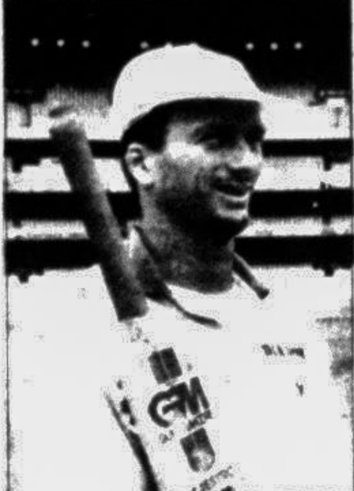
S WAUGH ... m-o-m