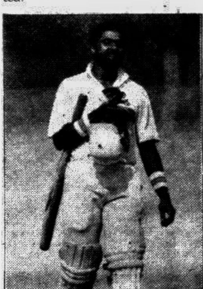
GURUSINHA ... 128

A key moment was the dismissal of Aravinda de Silva to cut short his threatening innings. He had made 19 in 17 balls when he attempted to on-drive left-arm pacesman Malcolm Jarvis, who clung onto a one-handed catch diving to his right. Medium pacer Guy Whittall returned his Test-best figures of four for 70 and fellow pacesman Heath Streak mopped up the tail to end with four for 79.