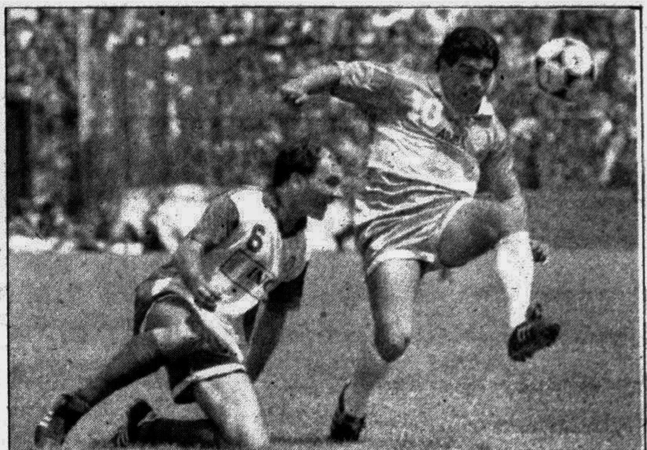
Diego Maradona takes the ball past Argentine actor Dario Grandinetti(L) during charity match in Buenos Aires on Oct 10. Maradona's side lost 4-6.

The Dutch attack is expected to be led by Inter Milan striker Dennis Bergkamp, recovered from an injury, with Bryan Roy given the same free role he has found success with at England's Nottingham Forest.