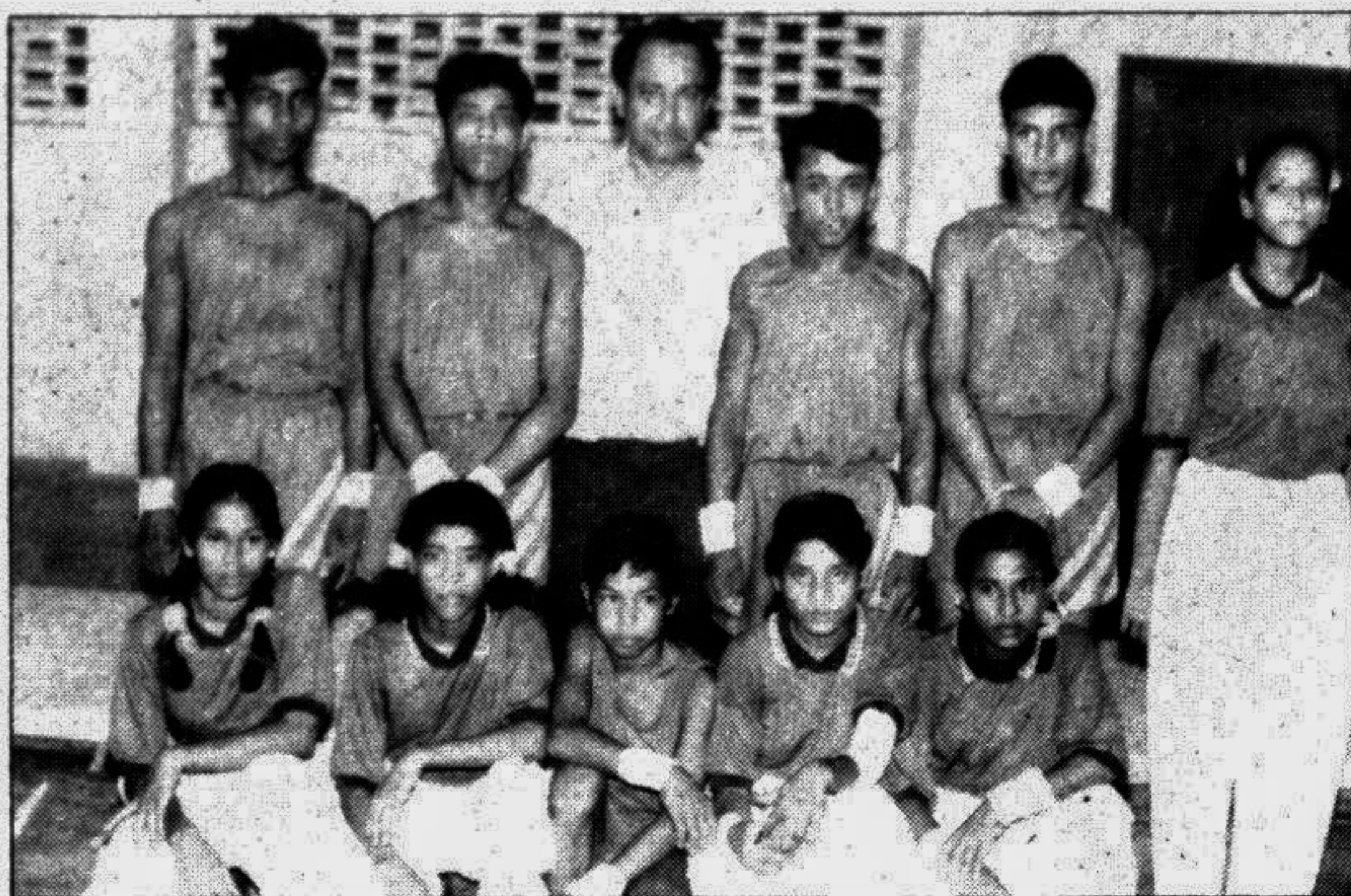
Members of the BTMC gymnastics team who emerged champions on the concluding day of the 11th national championships at the NSC gymnasium yesterday.

Coming off a victory last weekend at the Tokai Classic in Japan, Pavin travels to Wentworth's West Course attempting to become the first player to win the richest top prize in European golf in back-to-back years since Seve Ballesteros in 1984-85.