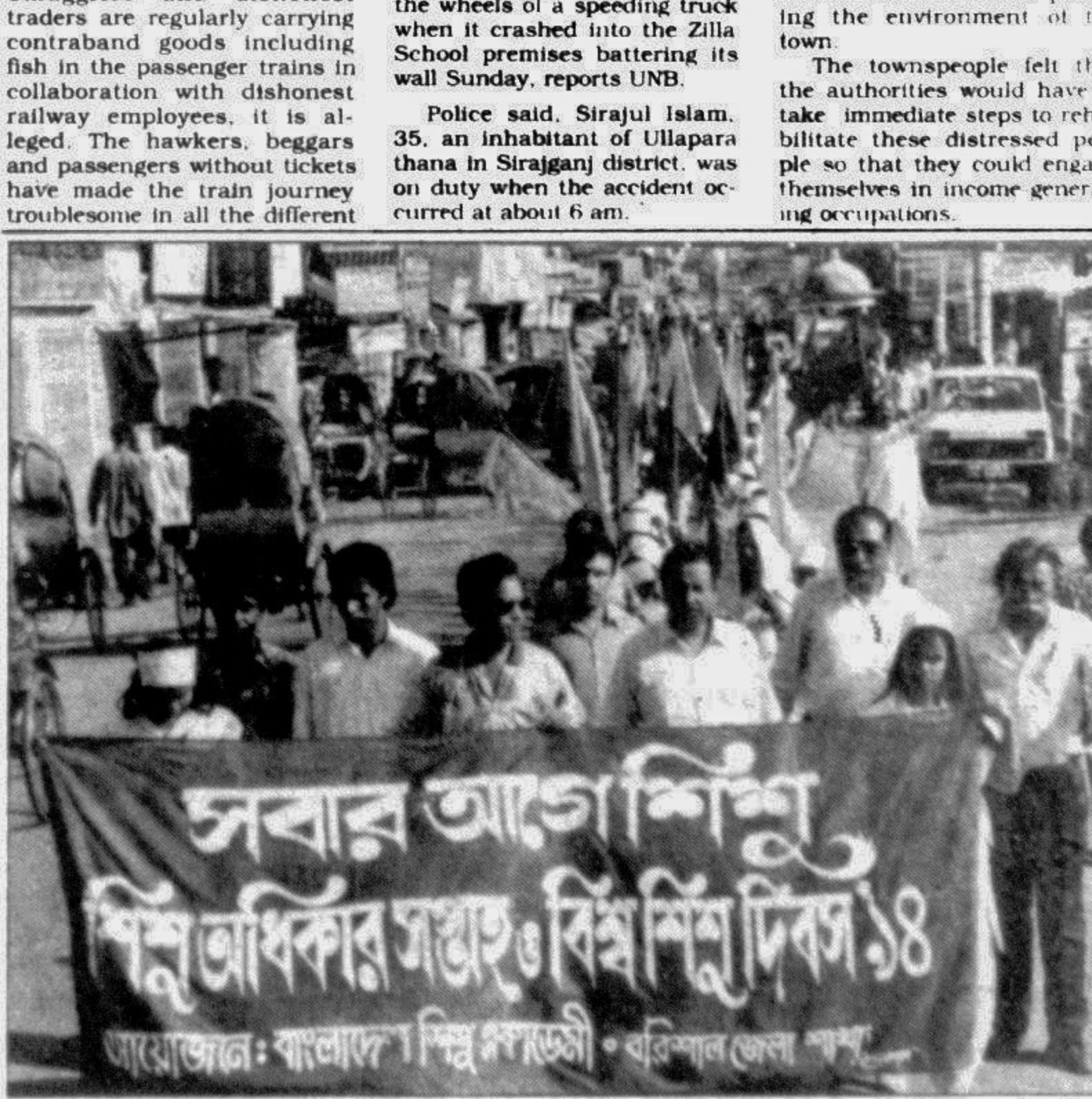
BARISAL: The Bangladesh Shishu Academy, Barisal chapter brought out a colourful procession recently to mark the World Childrens Day — '94.

From Our Correspondent BRAHMANBARIA, Oct 11: Influx of beggars in the district headquarters has increased abnormally in last two months, causing inconveniences to the town dwellers, reports UNB. Most of these beggars are women and children. The beggars, mostly floating people affected by natural calamities, are pouring into the town in large numbers from the rural areas of the district in search of food and work. The destitute finding no alternative to earn their livelihood, have taken up begging as a profession. Many of these people are also resorting to anti-social activities, the townspeople alleged. They also complained that with the onrush of beggars different types of infectious diseases have broken out in the town, particularly in slums and areas frequented by these rootless people. These floating people respond to call of nature in open fields and on roadsides polluting the environment of the town. The townspeople felt that the authorities would have to take immediate steps to rehabilitate these distressed people so that they could engage themselves in income generating occupations.