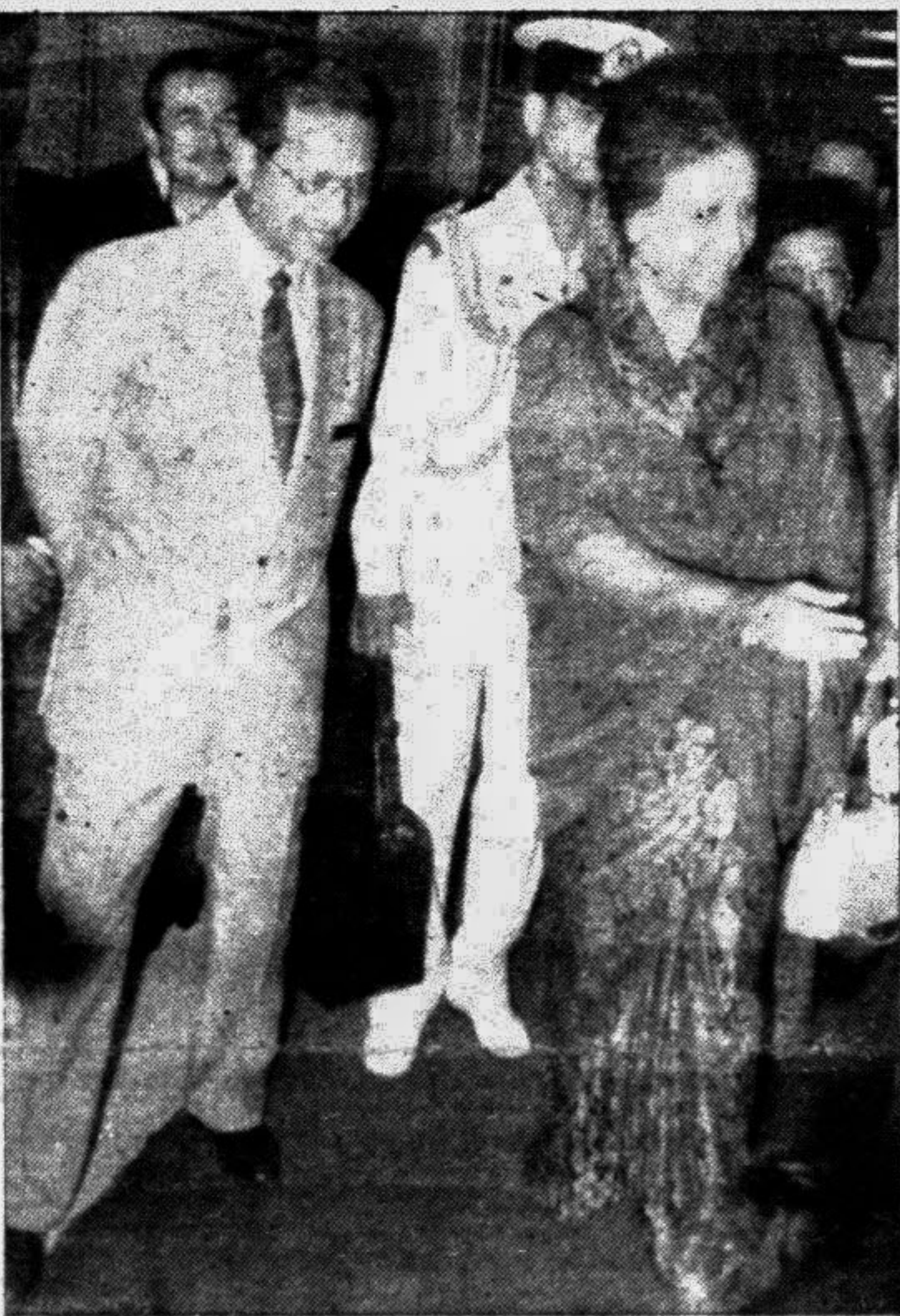
Bangladesh Prime Minister Begum Khaleda Zia walks beside Malaysian Premier Mahathir Mohamad (L) after arriving in Kuala Lumpur yesterday on a four-day official visit.

Foreign Minister ASM Mostafizur Rahman, Labour and Manpower Minister Abdul Mannan Bhuiyan, Special Envoy to the Prime Minister, M Morsheed Khan and principal secretary to the Prime Minister ANM Eusuf were present.