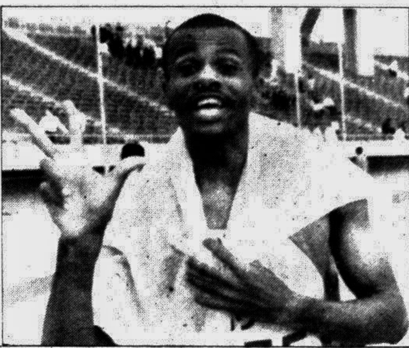
FASTEST MAN IN ASIA: Qatar's Talal Mansoor, draped in the national flag, completes a lap of honour after successfully defending his Asian Games 100m sprint crown for an unprecedented third time yesterday. Mansoor clocked 10.18 seconds. (Story on page 10)