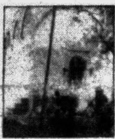
Dhakeshwari: A Shade of Past Glory Page 3