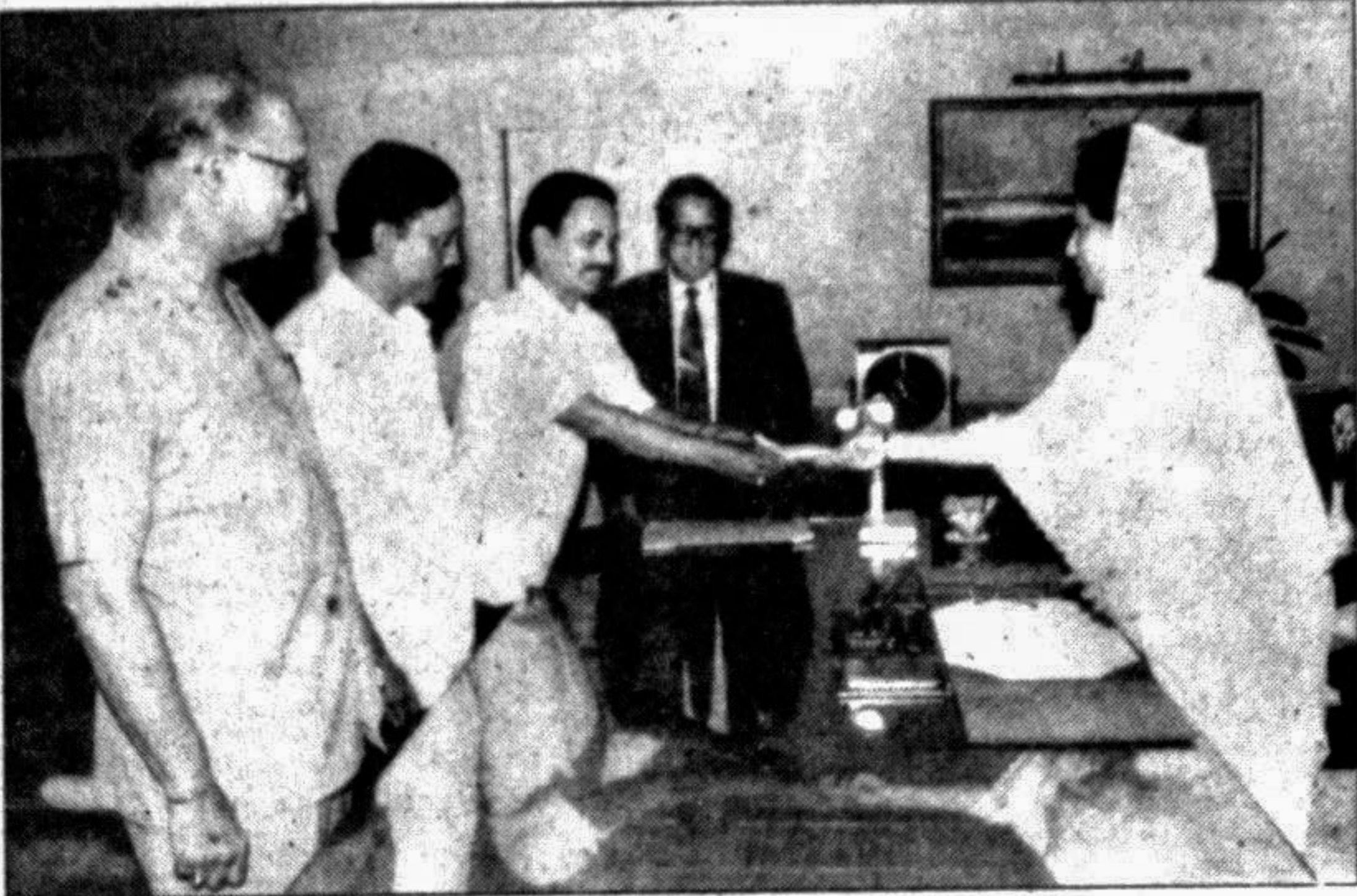
Prime Minister Begum Khaleda Zia handed over a cheque of Tk 25 lakh to vice-chairman of the Hindu Kalyan Trust and State Minister for Forest and Environment Goyeshwar Chandra Roy at her office yesterday as grant for development of different temples and celebration of the Durga Puja, beginning today. Foreign Minister A S M Mostafizur Rahman, State Minister for Social Welfare Fazlur Rahman and State Minister for Establishment Md Aminul Haque were present.