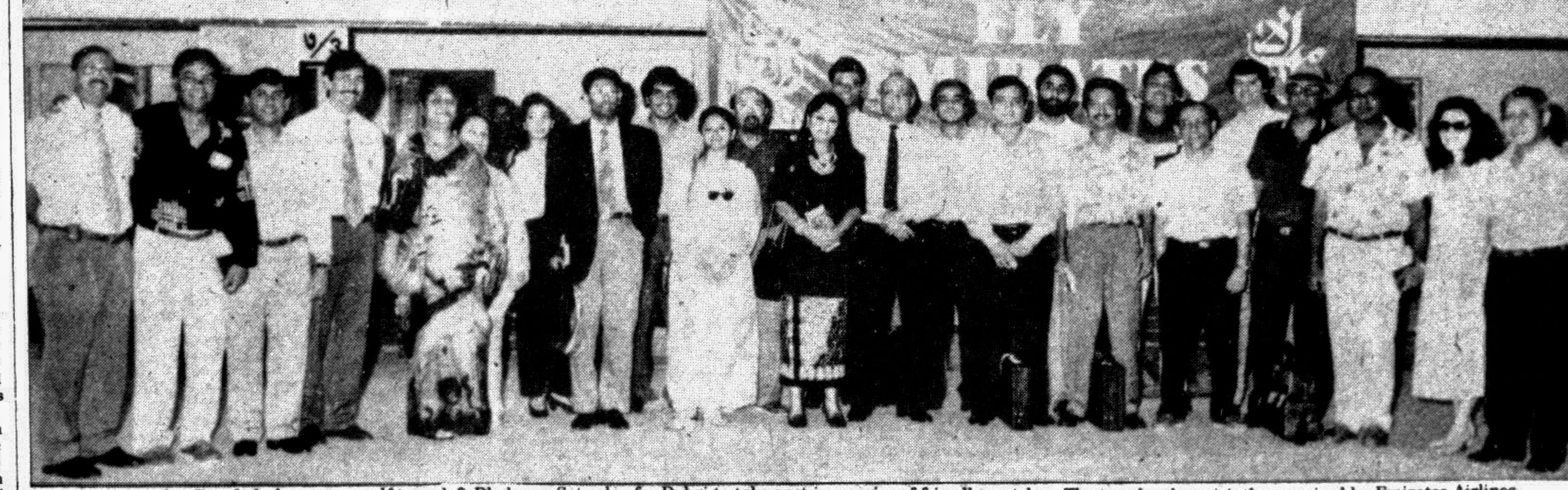
A 22-member Bangladesh amateur golf team left Dhaka on Saturday for Dubai to take part in a series of friendly matches. The tour has been jointly organised by Emirates Airlines and Travel International Ltd. This is for the first time such a tour has been organised.