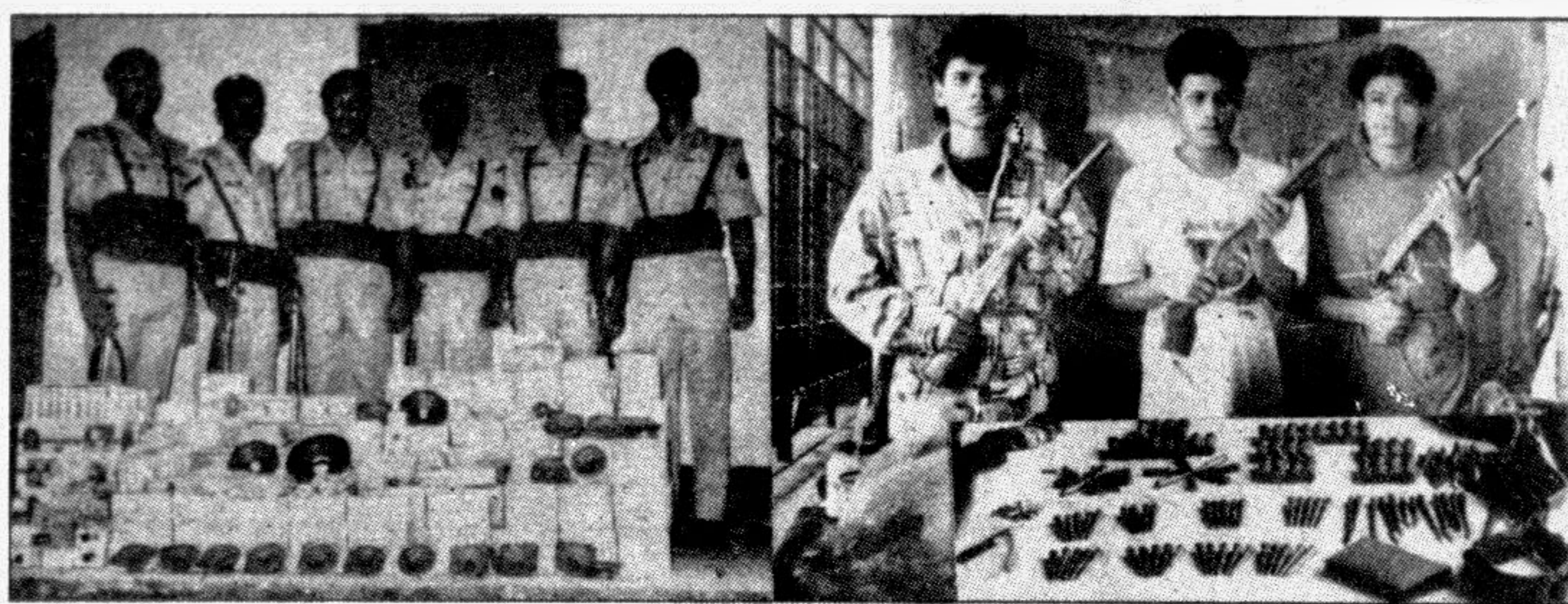
The BDR personnel in Jessore seized contraband Indian items from border area here under the Operation Treasure Hunt recently. Police recovered three cut rifles (R), explosive materials and cartridges from a house on the Electric Supply road, Sylhet recently. Three youngmen were also arrested in this connection.

From Our Correspondent KUSHTIA, Oct 9: Ferry services in Bheramara Paksey Ferry ghat is being hampered since last seven days due to emergence of chars in middle of river Ganges following rapid fall in water level. At present depth of water is only four to five feet disrupting ferry services, says a source. In last seven days ferries with fewer vehicles were plying increasing the length of queue of vehicles on both side of the ghat. It may be mentioned that this ferry ghat is the gate way between northern and southern part of Bangladesh. Imported grains and other essential commodities unloaded at Mongla Port are transported to Northern part through this Ferry ghat. However, Roads & Highways authority has taken up steps to remove the problems and arranged for dredging of the river. The Executive Engineer of R & H said that dredging has already been started. Taka 15 lakh has been allocated for the purpose.