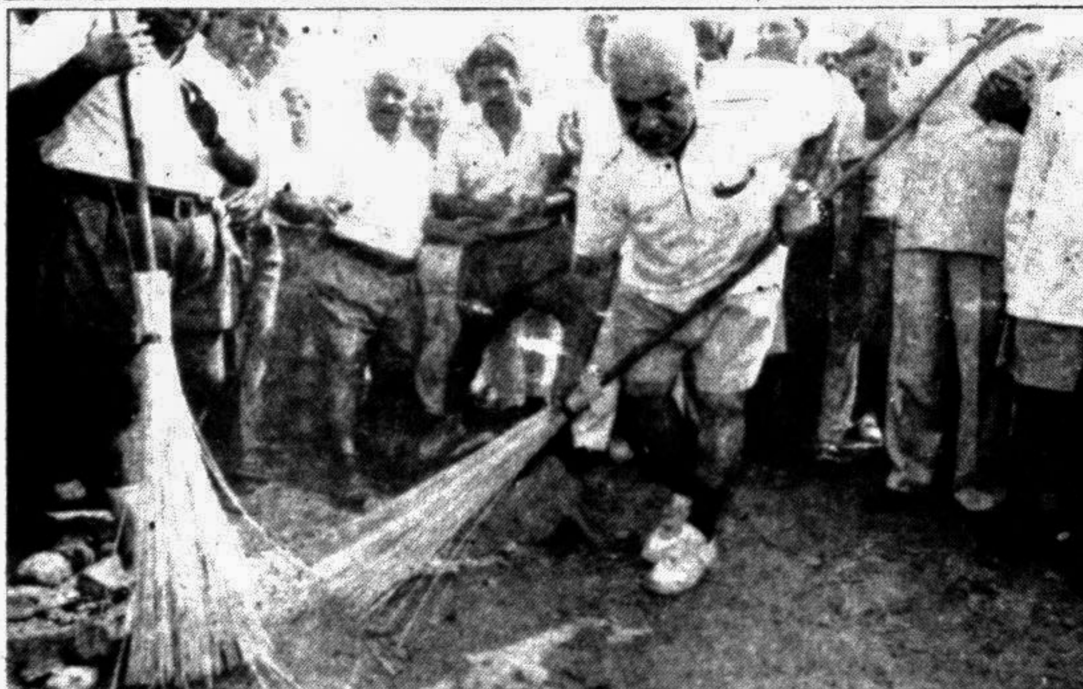
Madan Lal Khurana (R), Chief Minister of the Indian capital, cleans a New Delhi street of filth and garbage yesterday as part of a cleanliness drive. Authorities said piled up garbage across the city was responsible for outbreak of plague which has killed 56 people in India, including three in New Delhi.

Kodandaramiah said some 300 people were injured in the violence, in which scores of vehicles, shops and houses were attacked and torched.