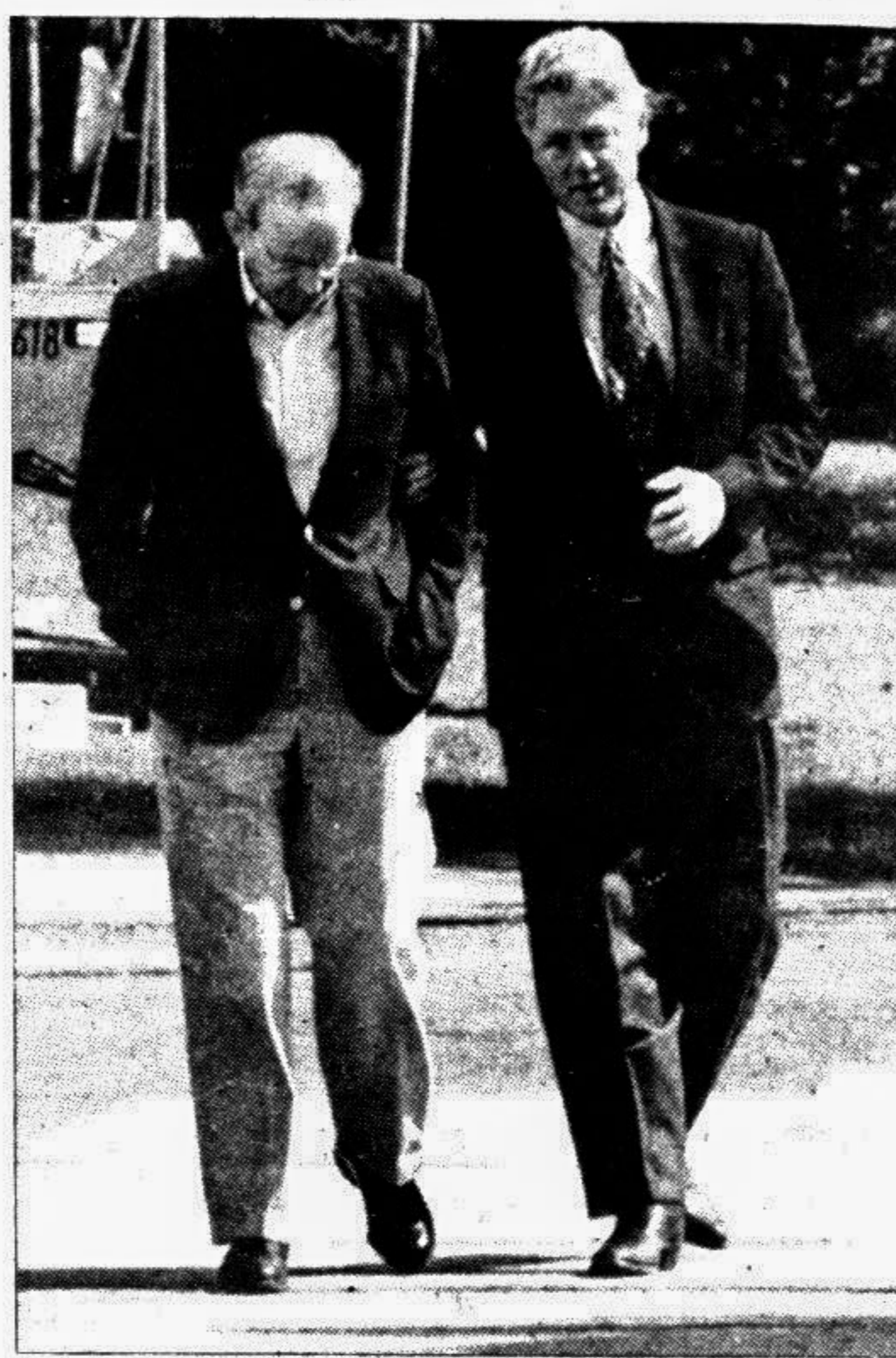
US President Bill Clinton (R) walks with National Security Advisor Anthony Lake Saturday in the premises of the White House after speaking to the press about the Iraqi troops near the Kuwait border. Clinton admonished Saddam Hussein not to misjudge "American will or American power."

The statement came as the entire Kuwaiti army was ordered to deploy along the border to ward off any threat from Iraqi troops massed near the Emirate.