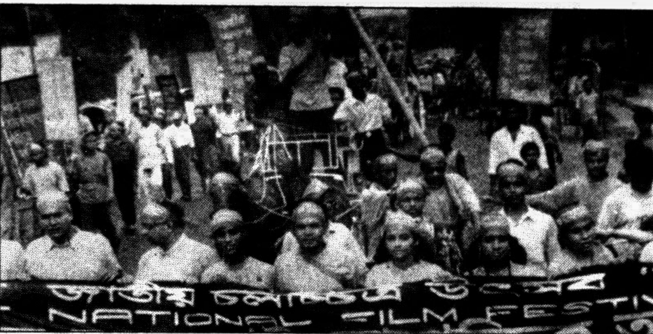
The Dhaka University Central Students Union (DUCSU) and Dhaka University Film Society (DUFSS) jointly brought out a procession in the city yesterday to mark the 4-day National Film Festival '94, which began October 8.