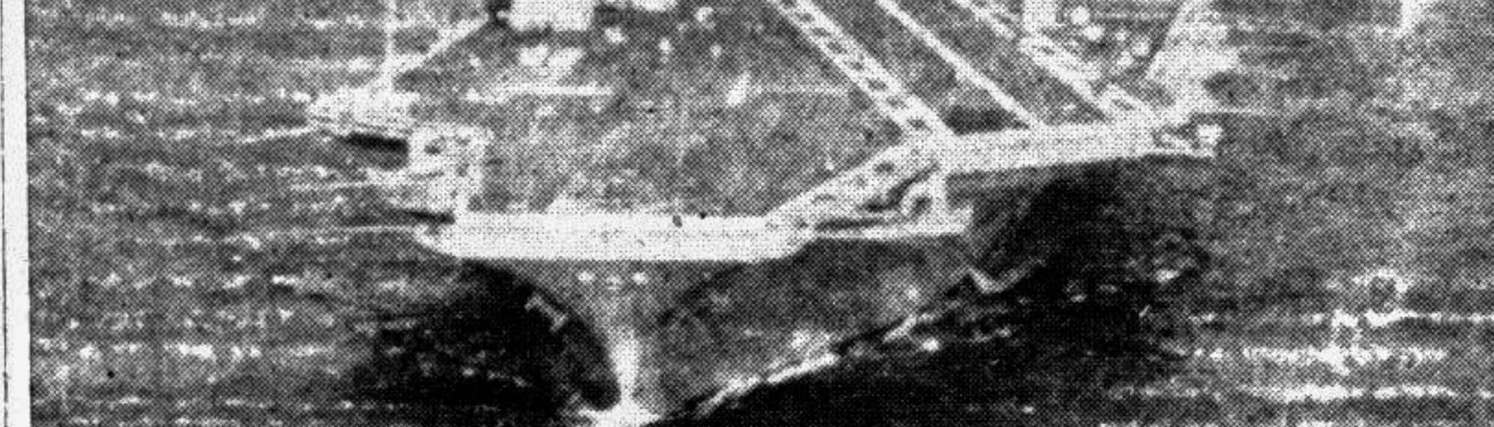
In this 1992 US Department of Defence file photo, the aircraft carrier USS George Washington is shown during sea trials off the Virginia Capes. The USS George Washington was dispatched to the Persian Gulf by US President Bill Clinton following reports Friday of Iraqi troops movements towards the Kuwaiti border.

UN observers reported the border quiet. However, they have no mandate to report on events beyond the demilitarized zone, which on the Iraqi side is 10 km (six miles)