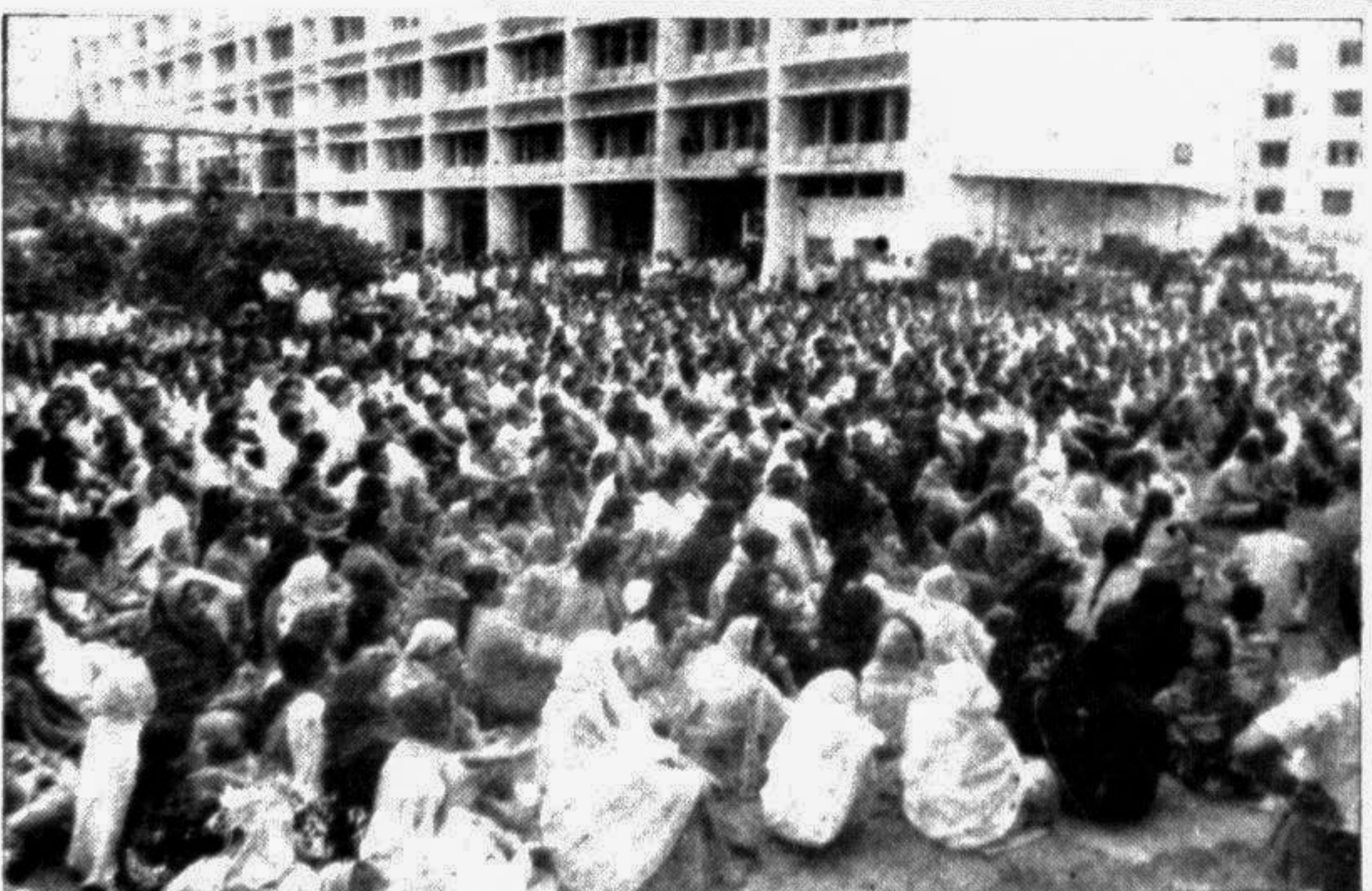
The Central Liaison Committee of the Secretariat Employees Coordination Council organised a meeting and a 4-hr work stoppage yesterday.

prepared to cover the loss by strengthening its capital base, the sources noted. A top official of the bank said such loss was incurred by the Malaysian central bank a few years ago which prompted it to increase its capital. The central banks of India and Pakistan have also strengthened their capital base by increasing their capital and reserve funds, he added. According to sources, the proposal made by the Bangladesh Bank is now being reviewed by the Finance Ministry. If approved by it, the proposal will be sent to the Law Ministry for examining the legal aspects of the matter. Implementation of the proposal will require amendments to the Bangladesh Bank order